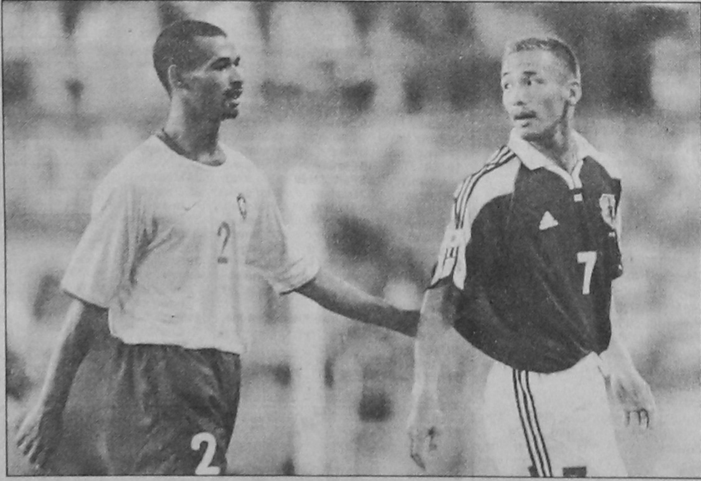
Ze Maria (L) of Brazil pats Japanese star Hidetoshi Nakata after their draw at Kashima on June 4.