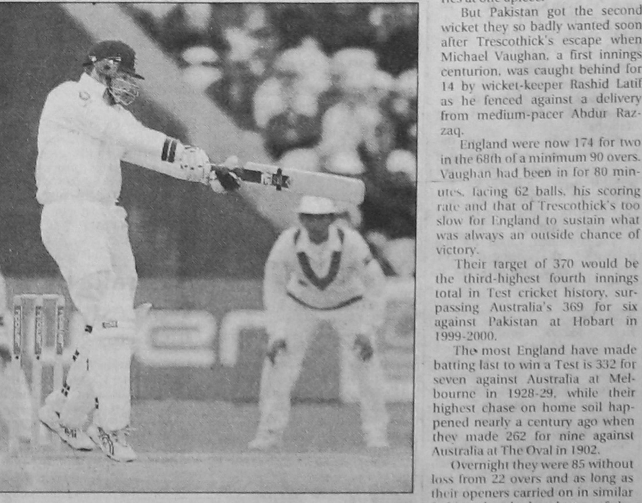
England opener Marcus Trescothick, who scored a century yesterday, square-cuts one on Sunday.

The most England have made batting last to win a Test is 332 for seven against Australia at Melbourne in 1928-29, while their highest chase on home soil happened nearly a century ago when they made 262 for nine against Australia at The Oval in 1902.