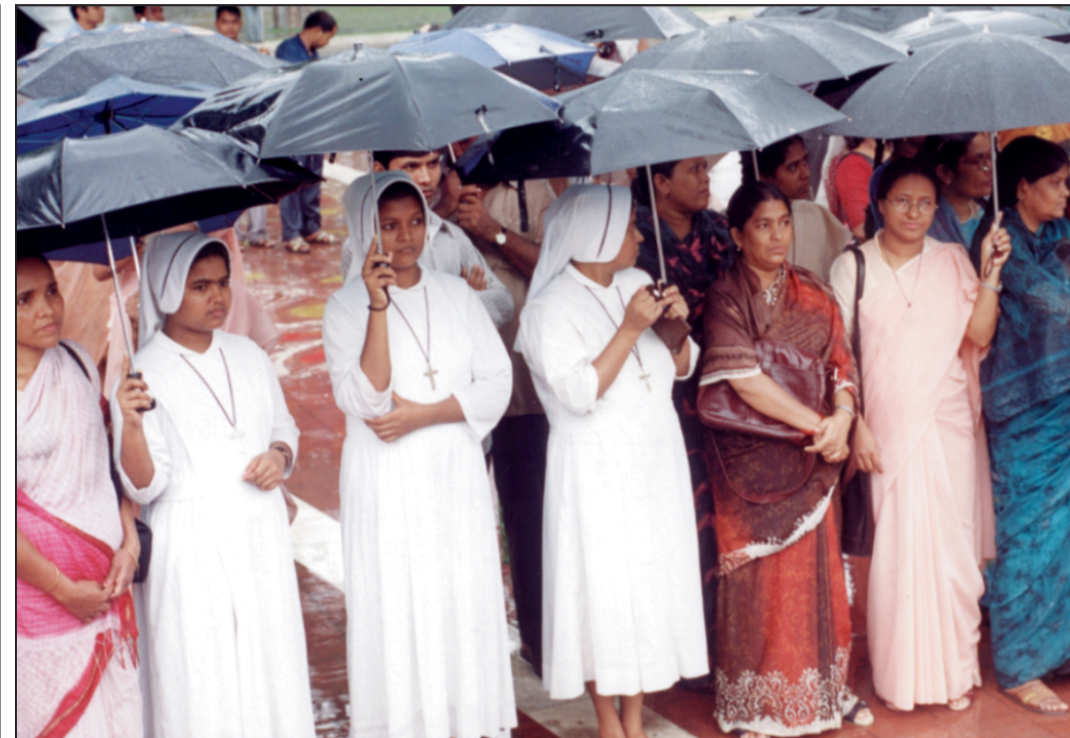
Three nuns along with scores of Christian women brave the rain to register their protest against Sunday's powerful explosion at Baniarchar Catholic Church that left ten people killed and 26 other injured.