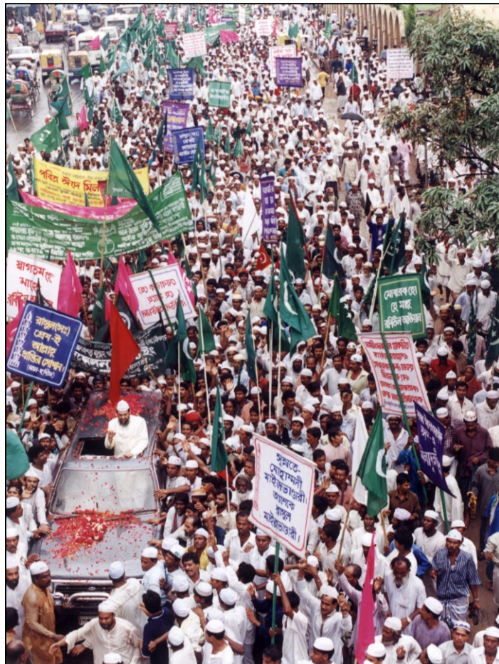
The followers of Majibhandari brought out a procession in the city yesterday on the eve of the Eid-e-Miladunnabi.