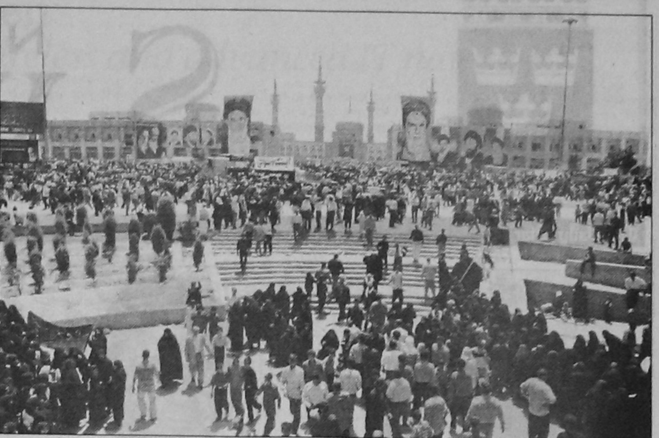
People gather outside the mausoleum of the founder of the Islamic republic Ayatollah Ruhollah Khomeini at the southern outskirts of Tehran yesterday to attend a ceremony marking the 12th anniversary of Khomeini's death.

Most families in the remote mountain district of Kohistan had sold most of their livestock.