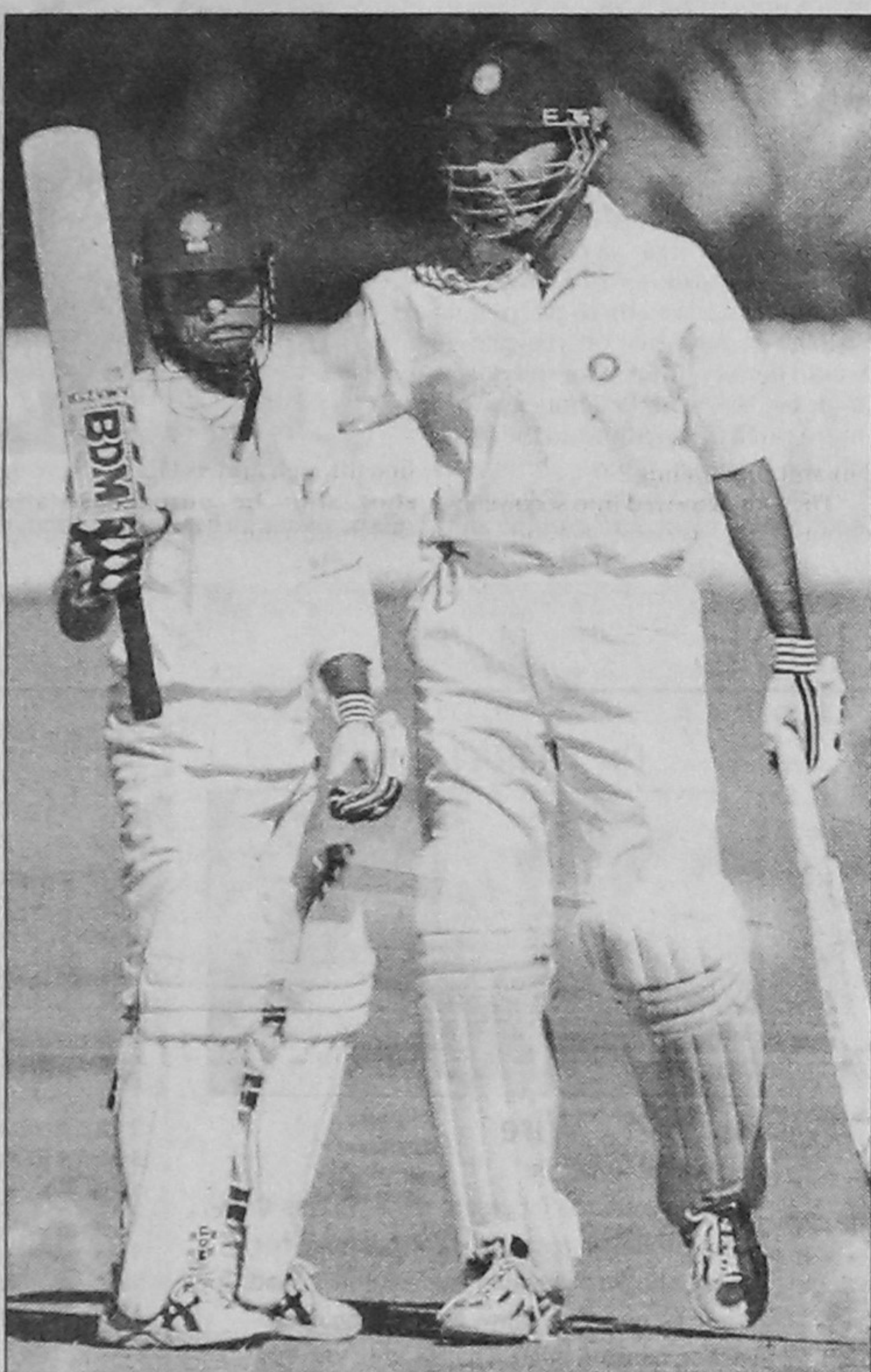
Indian opener Shiv Sunder Das raises his bat to the crowd after completing a century against the Zimbabwe Academy team on Saturday.