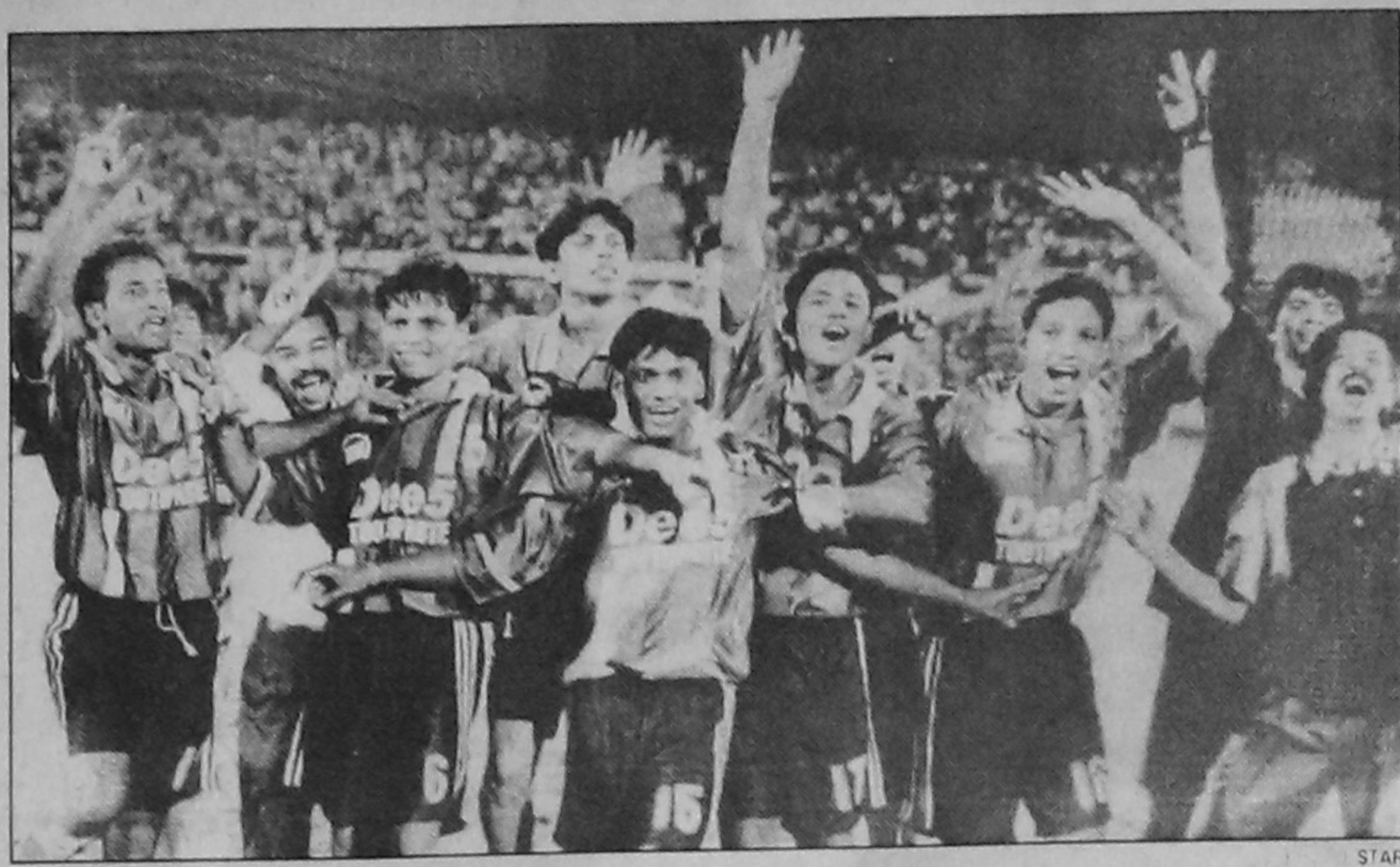
Arambagh players start to celebrate after beating Mohammedan.