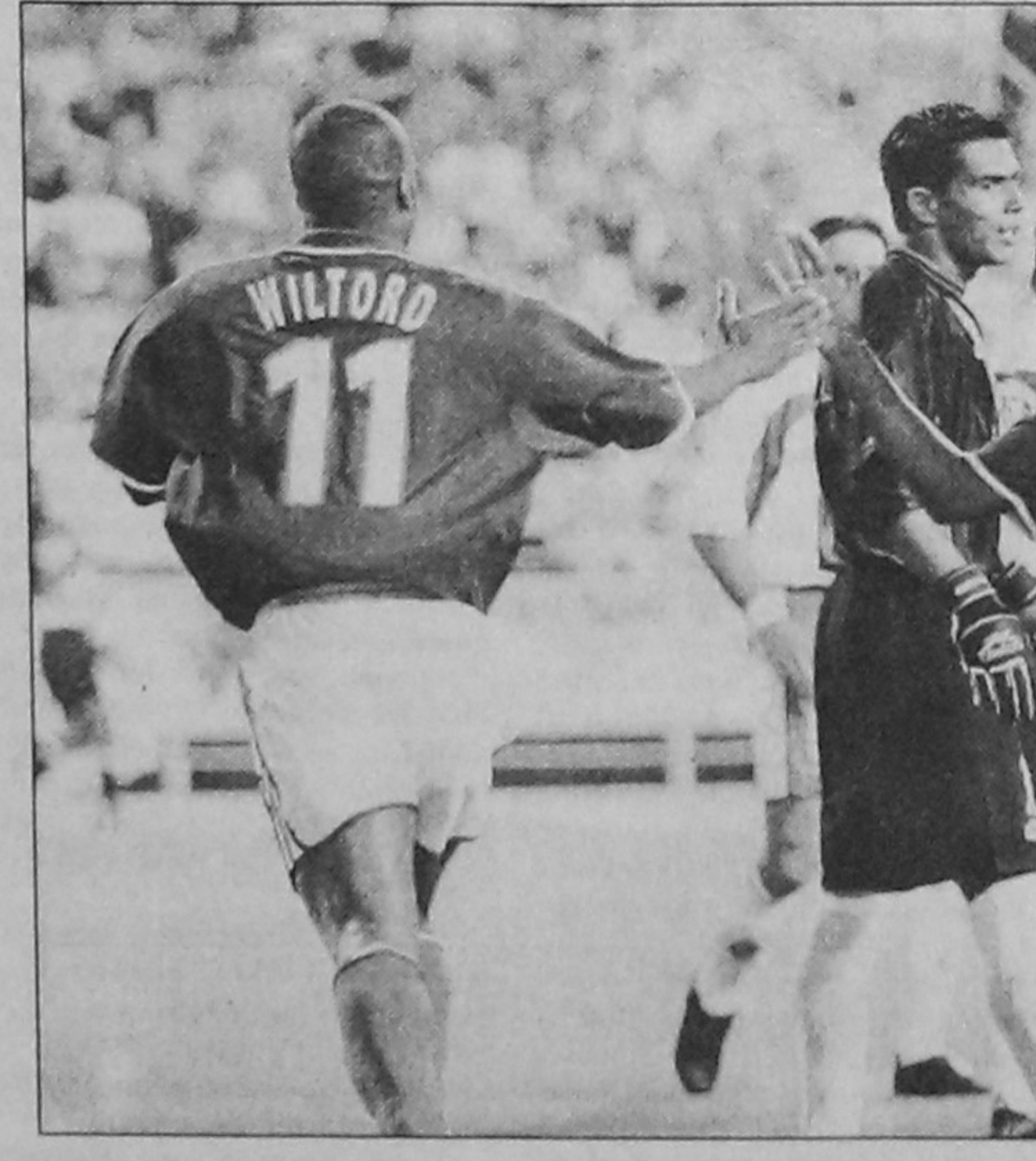
WELL DONE PARTNER! Nicolas Anelka (R) congratulates striking partner Sylvain Wiltord (L) on scoring France's opening goal against Mexico at Ulsan on June 3.

first half but rarely threatened in the second. The French picked up the pace in the second half after a sluggish opening, with fullbacks Willy Sagnol and Bixente Lizarazu exploiting a lack of pace in the Mexican defence down the flanks. They added to their lead in the