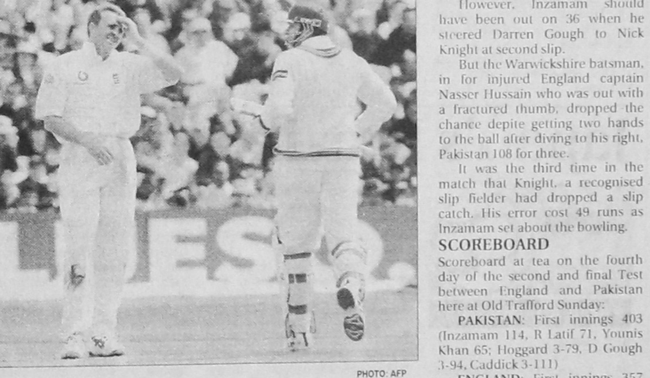
England paceman Dominic Cork contemplates a close call as Inzamamul Haq sets off for a run in Manchester yesterday.