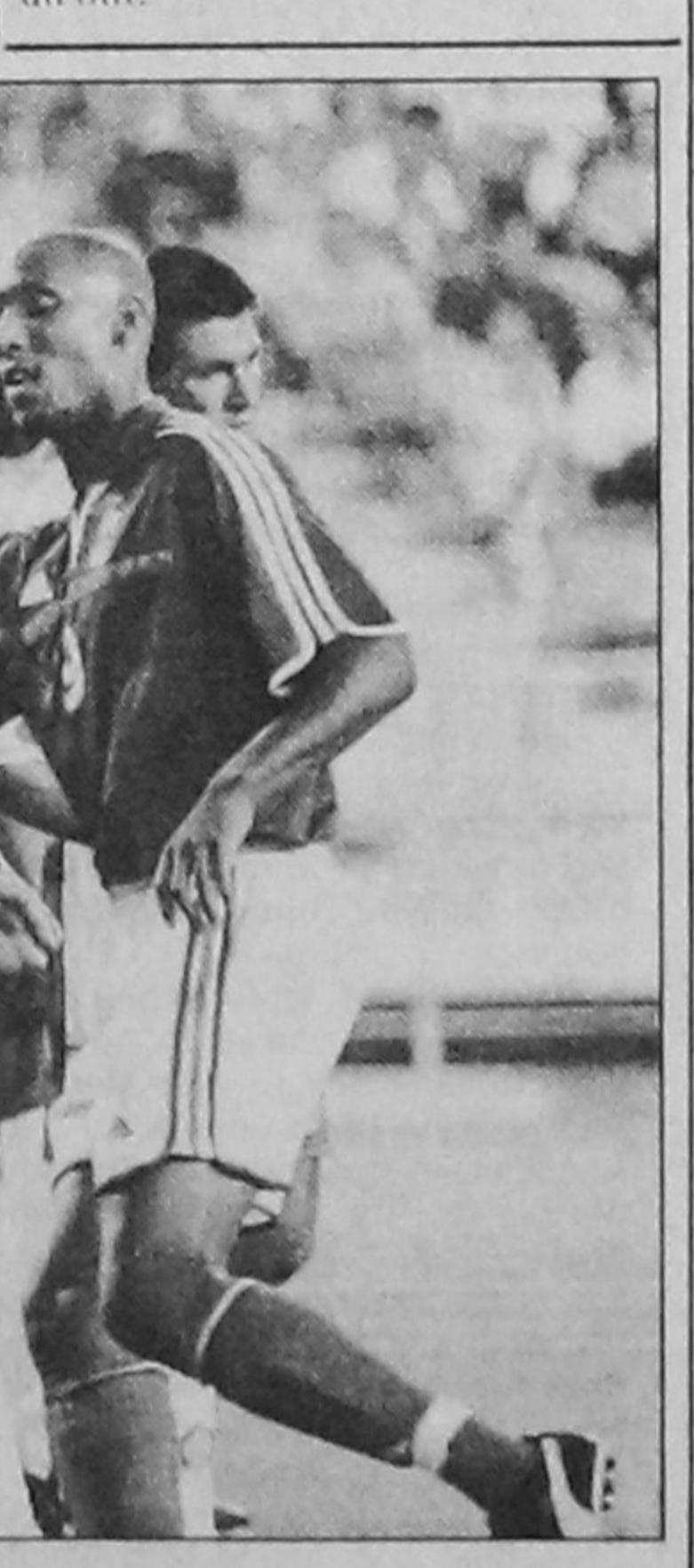
SEE PAGE 15

STAR SPORT MONITOR England chasing 370 for victory in the second and final Test against Pakistan, were 28 for no loss yesterday. Earlier, the tourists took their tea score from 274 for seven to 323 all out.