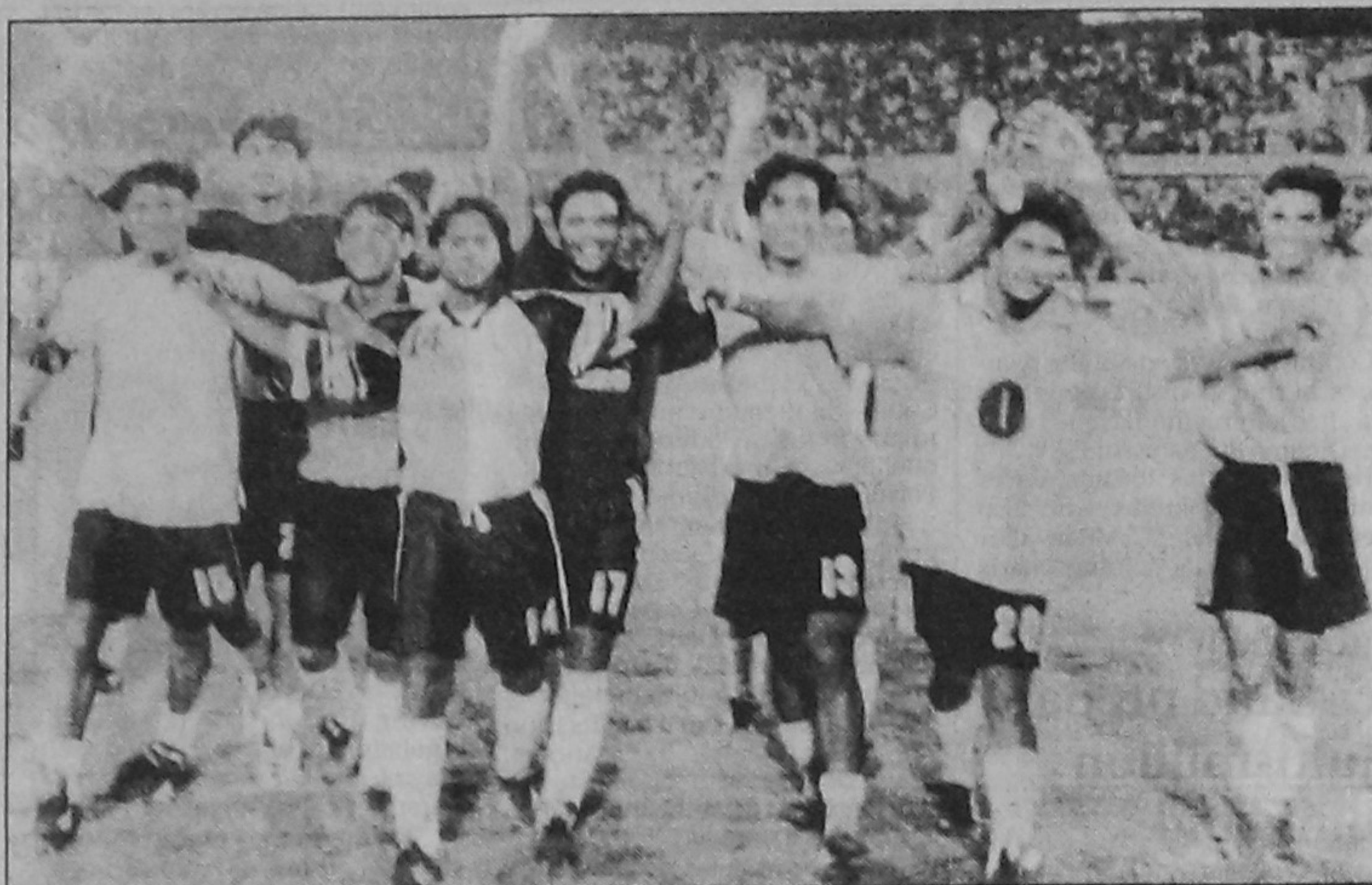
Arambagh players celebrate their entry into the Federation Cup semifinals at the Bangabandhu National Stadium yesterday.