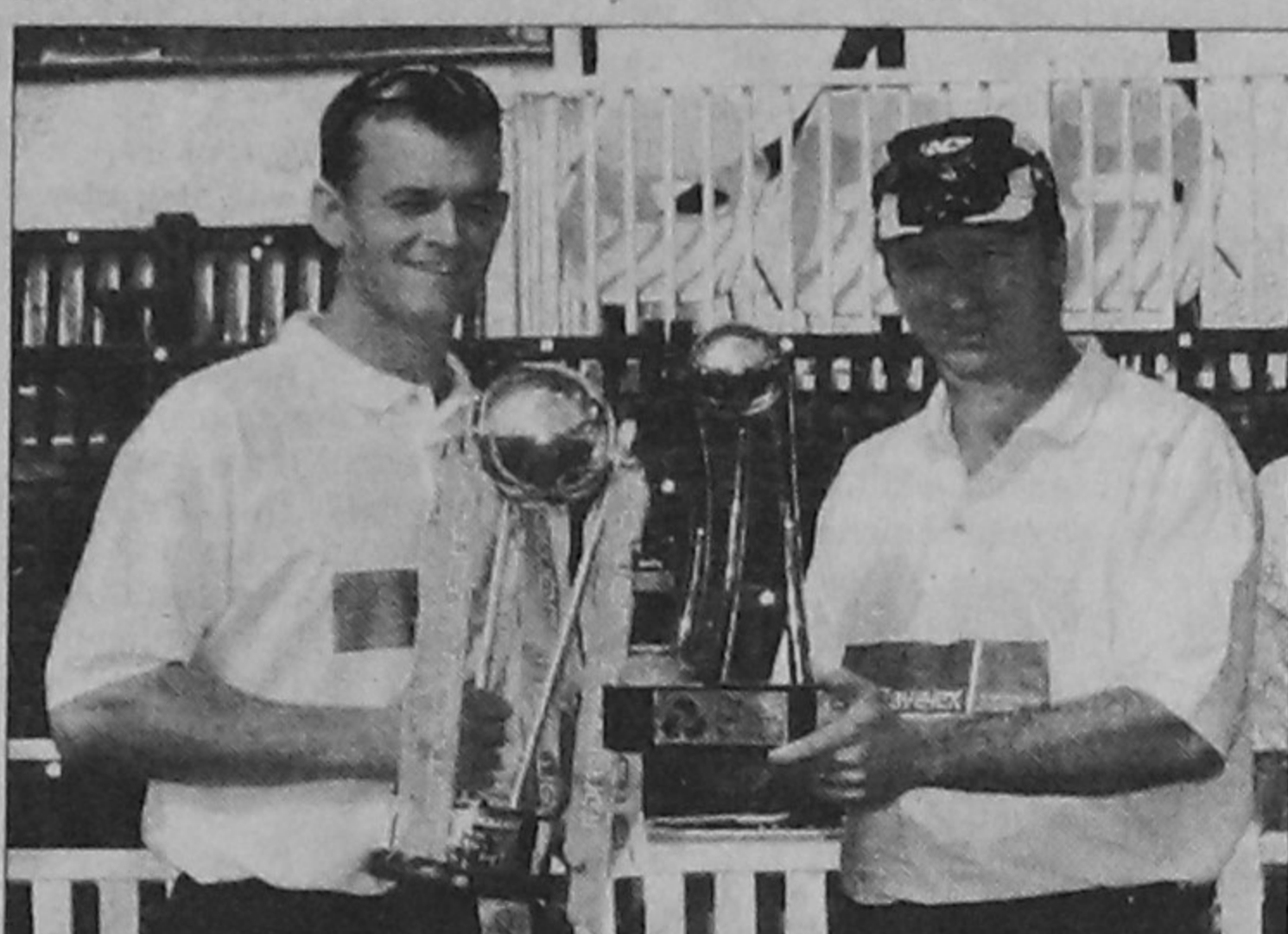
THE TROPHIES THEY ARE AFTER: Australia captain Steve Waugh (R) and his deputy Adam Gilchrist hold the trophies for the Ashes Test series and NatWest tri-nation one-day competition after a press conference at New Road, Worcester yesterday.

"Nasser (Hussain) has led well. The personnel is similar to what they had in previous years but perhaps they now have more direction," he said.