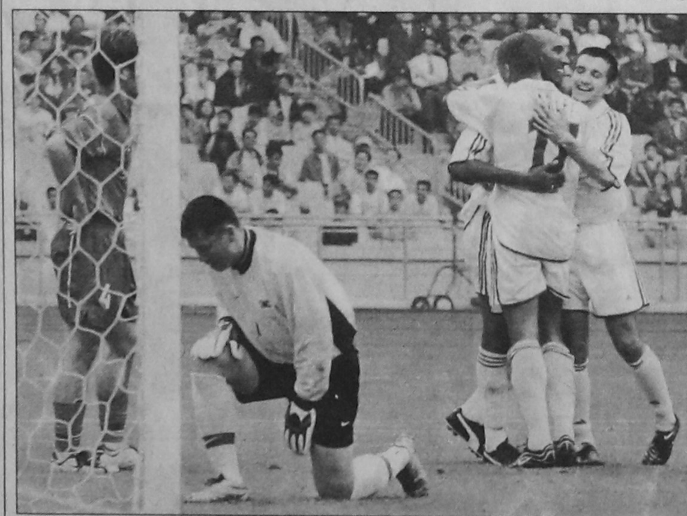
France's Nicolas Anelka (2nd from R) being congratulated by teammates after his strike as a dejected South Korean goalkeeper Lee Woon-Jae takes time to recover during their Confederations Cup at Taegu yesterday.

praying their side would not concede more. In the end, only a penalty save by Lee Woon Jae stopped South Korea falling to a home humiliation worse than their Asian rivals. "We must be realistic and face the fact that there is a long way to go to bridge the gap," said Hiddink of his team's performance and ability. "Some players match up and some have some deficiencies." French coach Roger Lemerre said it was "a superb performance" by his team and that it was not noticeable two players were newcomers. South Korea were soon given an indication of the gap between the best in Asia and those in Europe. Marlet scored in the eighth minute. SEE PAGE 15