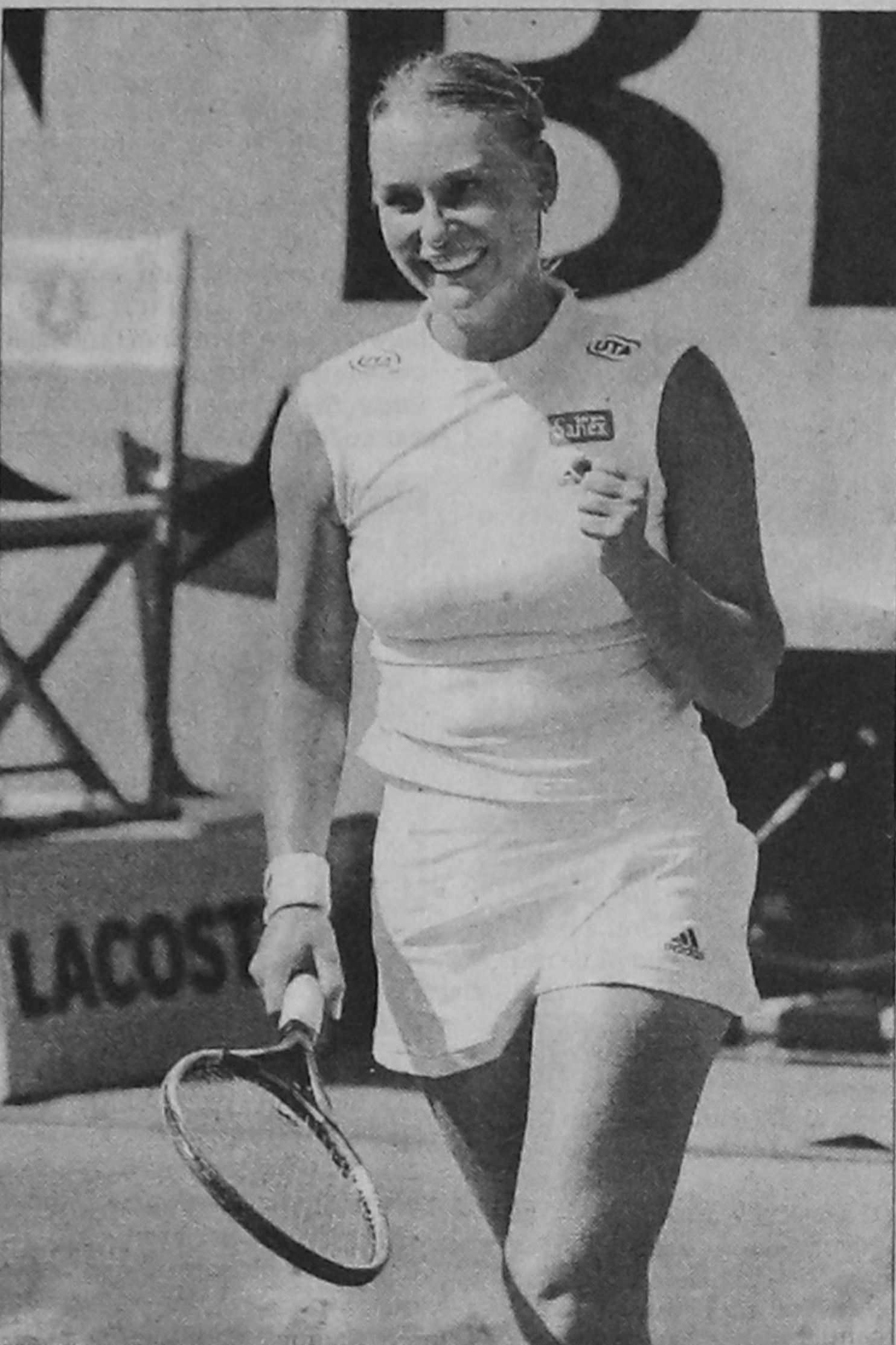
Austrian Barbara Schett celebrates after beating American Venus Williams in the first round of the French Open on Monday.

Spanish fourth seed and Rome Masters Series champion Juan Carlos Ferrero progressed by ousting Austrian Stefan Koubek in straight sets.