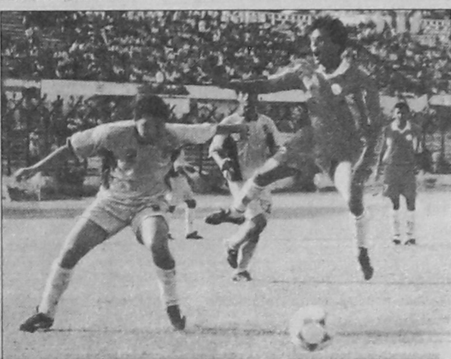
Action from yesterday's Federation Cup fixture between Muktijoddha and Rahmatganj.