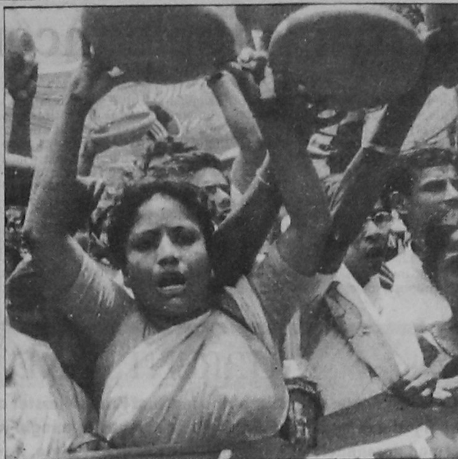
The evicted hawkers staged a demonstration in the city yesterday demanding their rehabilitation.

Chief Operating Officer Grameen Star Education Grameen Software Ltd. Grameen IT Park (11th Floor) Grameen Bank Bhaban Mirpur-2, Dhaka-1216.