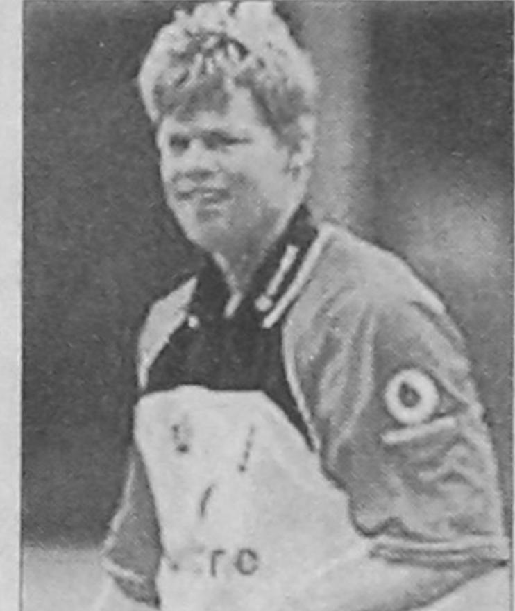
NICK KNIGHT with Ian Ward having only just made his debut, we decided to go for a more experienced player and we considered Mark Ramprakash and John Crawley as well as Nick Knight.