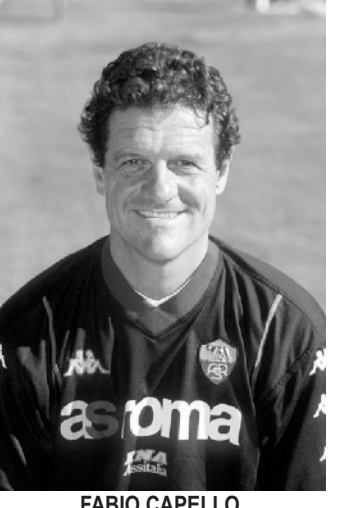
FABIO CAPELLO would once more be blown wide open.

FIXTURES (all 1830 GMT) Sunday: AS Roma v AC Milan, Brescia v Vicenza, Fiorentina v Atalanta, Inter Milan v Lazio (at Bari), Juventus v Perugia, Lecce v Parma, Reggina v Bari, AS Roma v Milan, Udinese v Napoli, Verona v Bologna