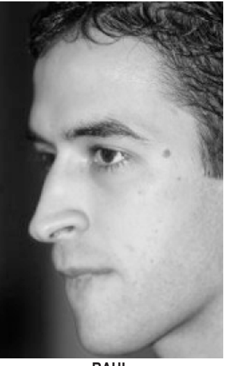
RAUL last year without a fight, and will be bidding for a home win against relegation-threatened Valladolid.

Meanwhile, reigning champions Deportivo aren't going to hand over the title they won for the first time