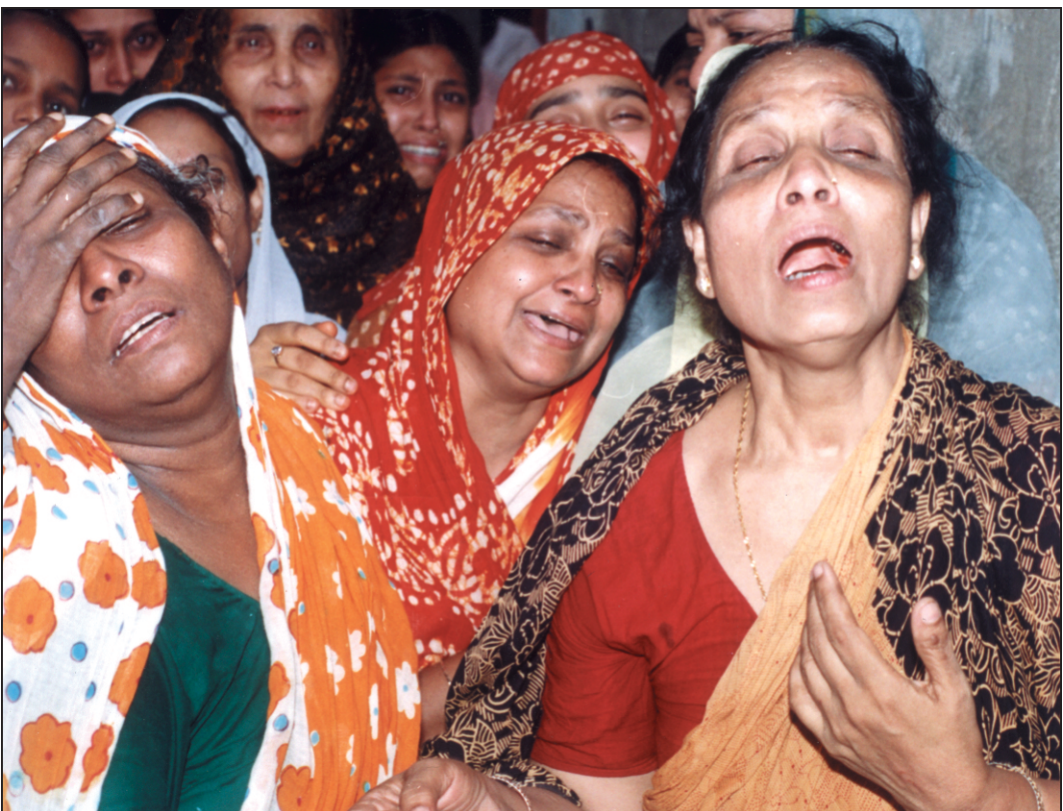
Relatives mourn the death of mother and her daughter, who were killed at DCC staff quarters at Maniknagar in the city's Demra area Wednesday.