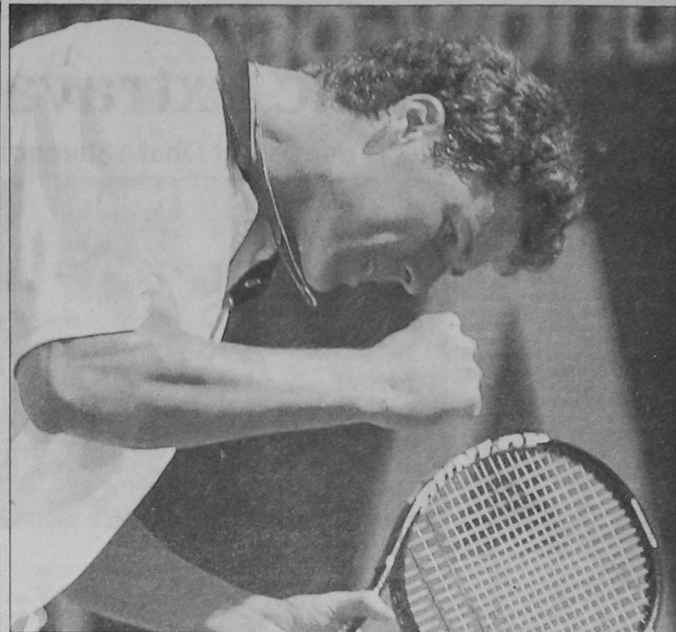
Russian Marat Safin exults after beating American Pete Sampras in the World Team Cup encounter in Duesseldorf on May 22.

In reply, Abahani (Junior) were bundled out for 78 in 22.3 overs.