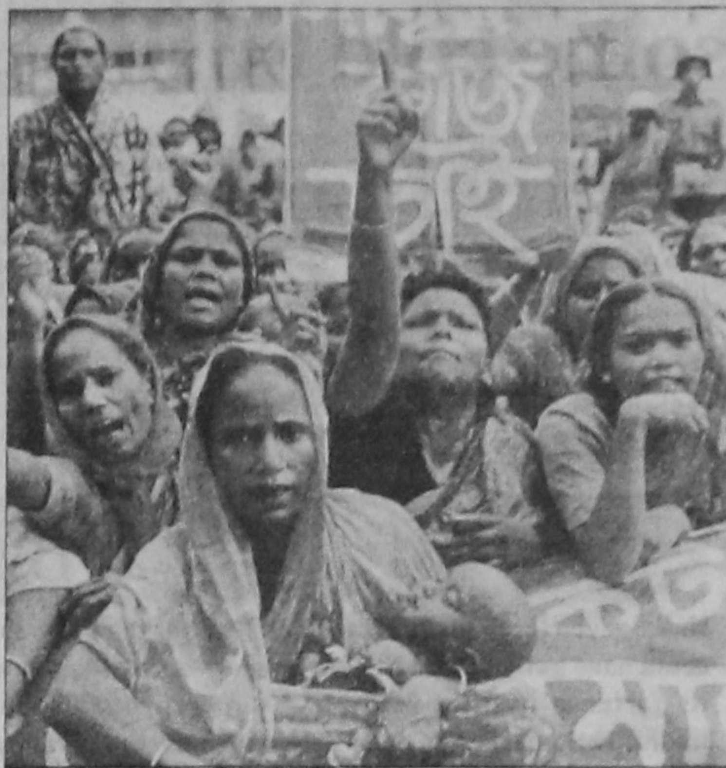
Women Labourers Union took to the city streets and held a rally yesterday demanding employment.

Executive Vice President Common Services Division.