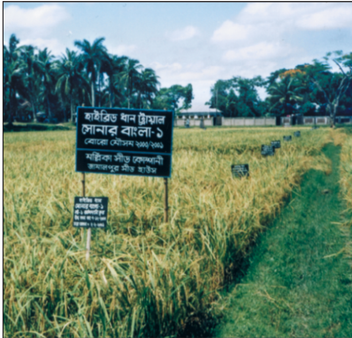
Hybrid paddy on a stretch of land could become a rare sight soon, if the government fails to release any home-grown variety or extends the time limit for seed import.