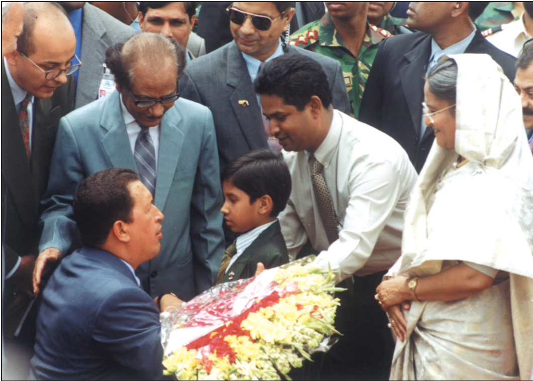
Venezuelan President Hugo Rafael Chavez receives a bouquet from a little boy on his arrival at the Zia International Airport yesterday as President Shahabuddin Ahmad and Prime Minister Sheikh Hasina look on.