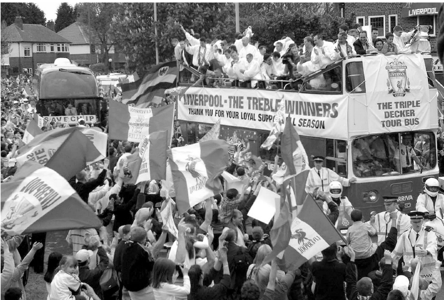
THE LIVERPOOL BUS IS COMING! Proud Liverpool residents cheer the treble winning team (on board the double decker bus) on May 20.