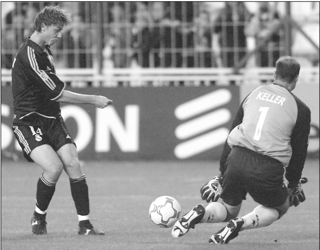
Real Madrid's Guti (L) about to score against Rayo Vallecano on May 20.

Goalkeepers - German Burgos (Real Mallorca), Pablo Cavallero (Celta Vigo) Defenders - Roberto Ayala (Valencia), Nelson Vivas (Arsenal), Mauricio Pochettino (Paris St Germain), Roberto Sensini (Parma), Eduardo Berizzo (Celta Vigo) Midfielders - Javier Zanetti (Inter Milan), Diego Simeone (Lazio), Juan Pablo Sorin (Cruzeiro), Juan Sebastian Veron (Lazio), Matias Almeyda (Parma), Marcelo Gallardo (Monaco), Pablo Aimar (Valencia), Kily Gonzalez (Valencia). Forwards - Hernan Crespo (Lazio), Claudio Lopez (Lazio), Gustavo Lopez (Celta Vigo)