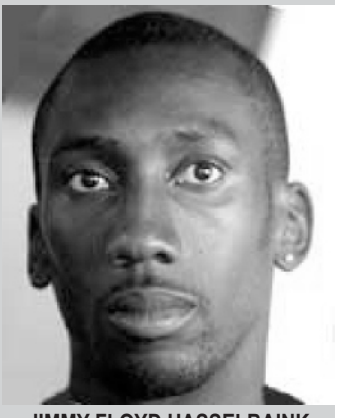
JIMMY FLOYD HASSELBAINK