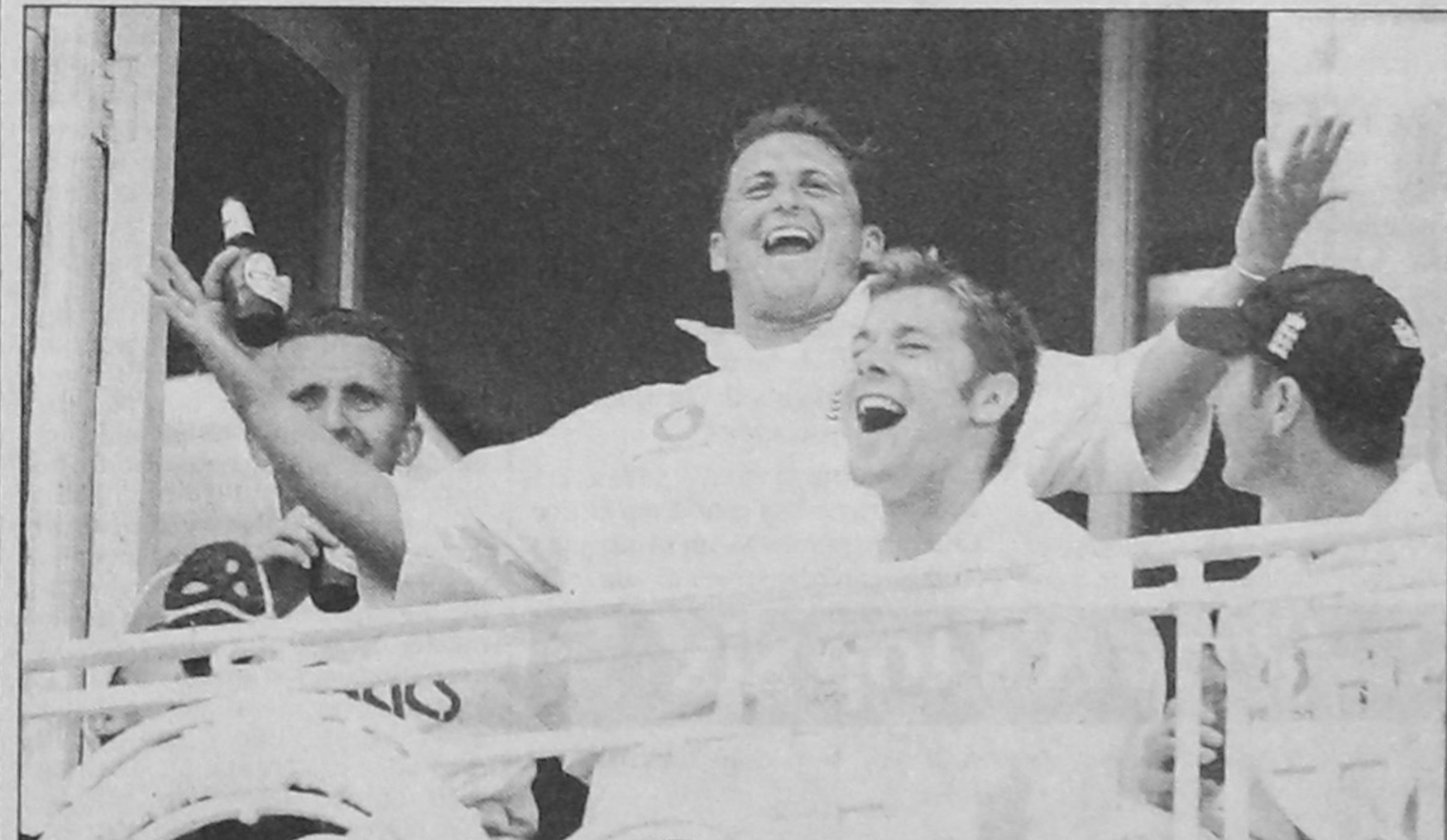
England fast bowler Darren Gough leads the party on the Balcony of Lord's after their victory over Pakistan in the first Test on Sunday.

However, Michael Vaughan, who was stationed for the catch at backward square leg dropped the routine chance. Fortunately for England eight balls later Caddick