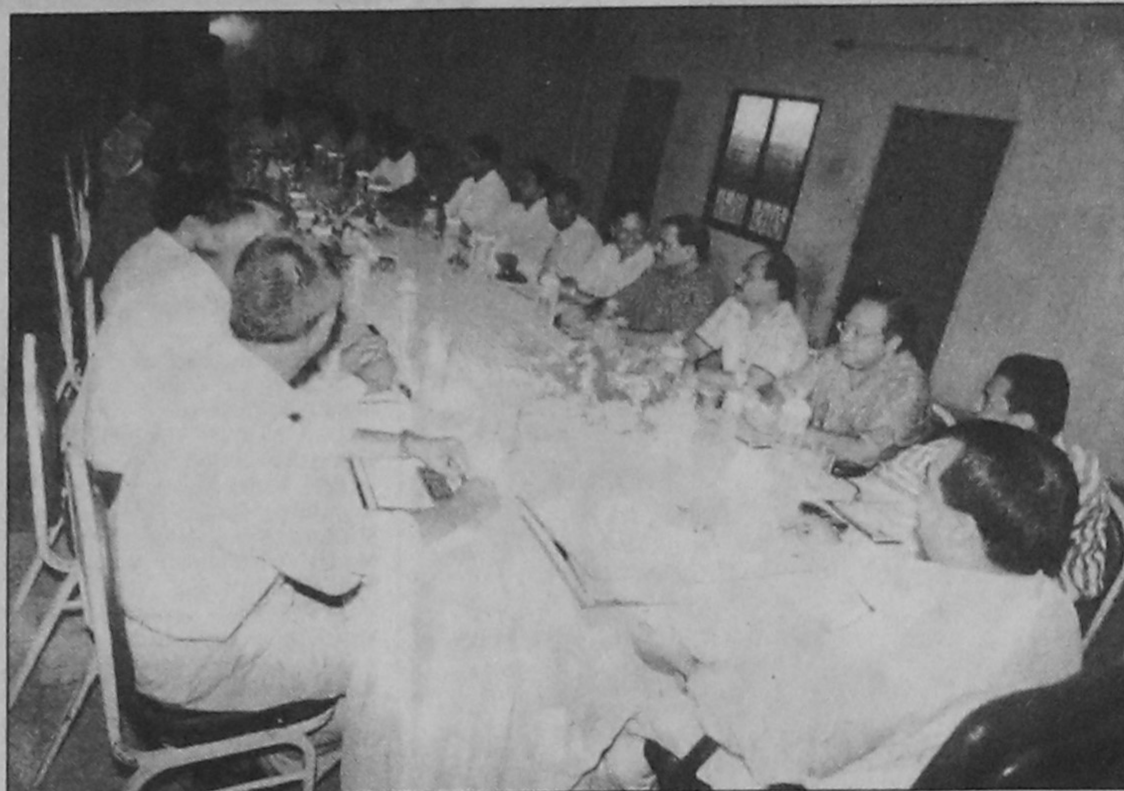
The new Bangladesh Cricket Board (BCB) Board of Directors met for the first time yesterday at the conference room of the Bangabandhu National Stadium.