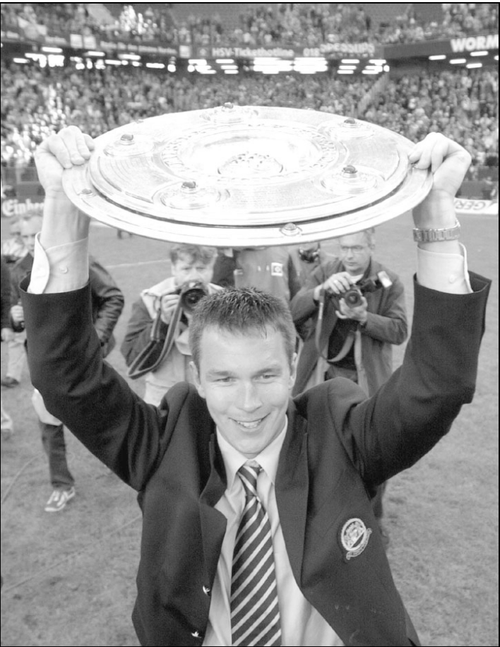
WE ARE THE BUNDESLIGA KINGS: A combination of photos showing (L) Bayern Munich duo Roque Santa Cruz and Paolo Sergio are ecstatic after the final whistle and (R ), hero of the match Patrick Andersson proudly lifts the Bundesliga trophy.