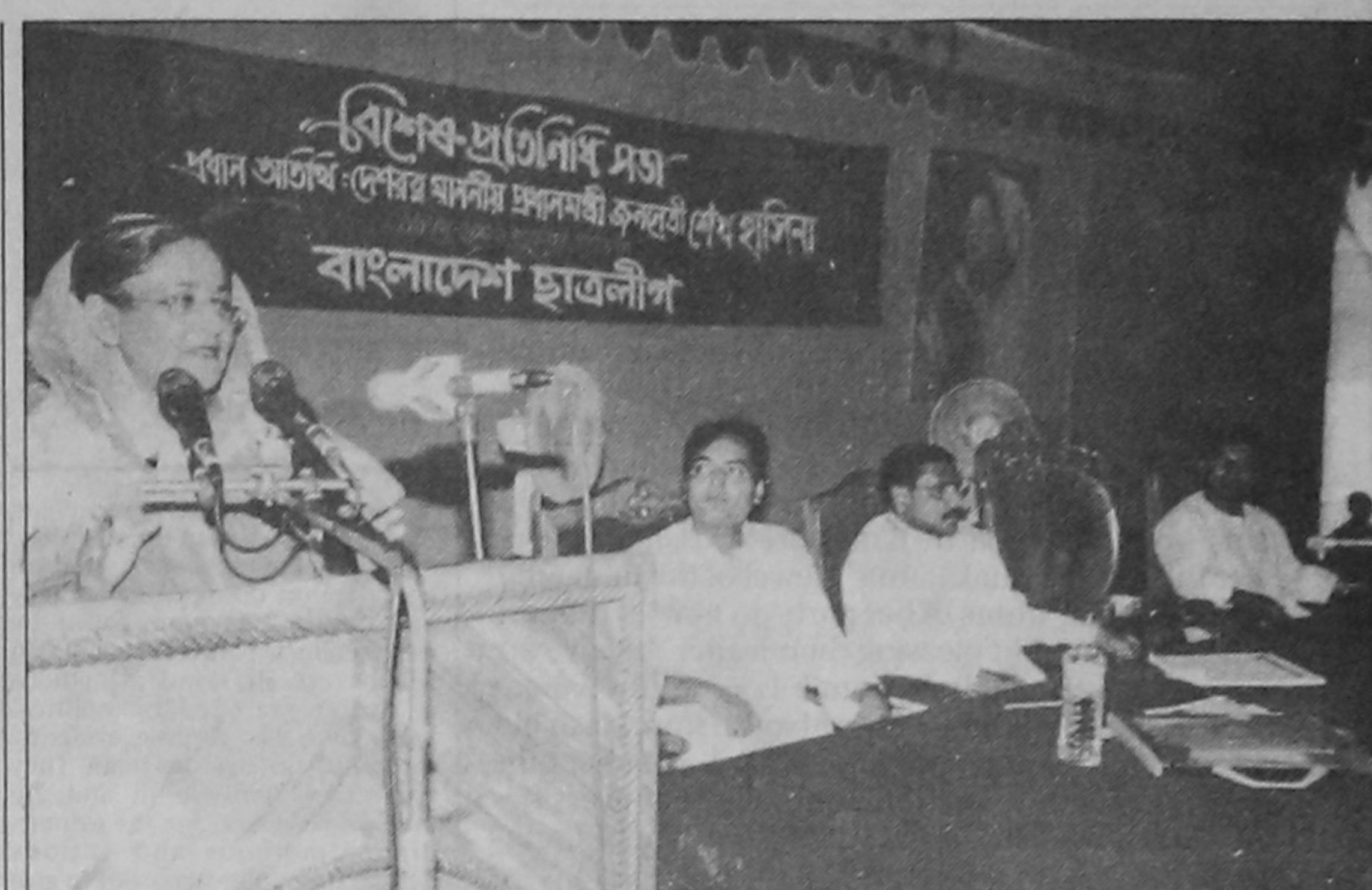
Prime Minister Sheikh Hasina addressing a special representatives' meeting of the Bangladesh Chhatra League at her official residence in the city yesterday.

A charge sheet was submitted against 14 people. The court acquitted the accused after cross-examination of all 11 prosecution witnesses.