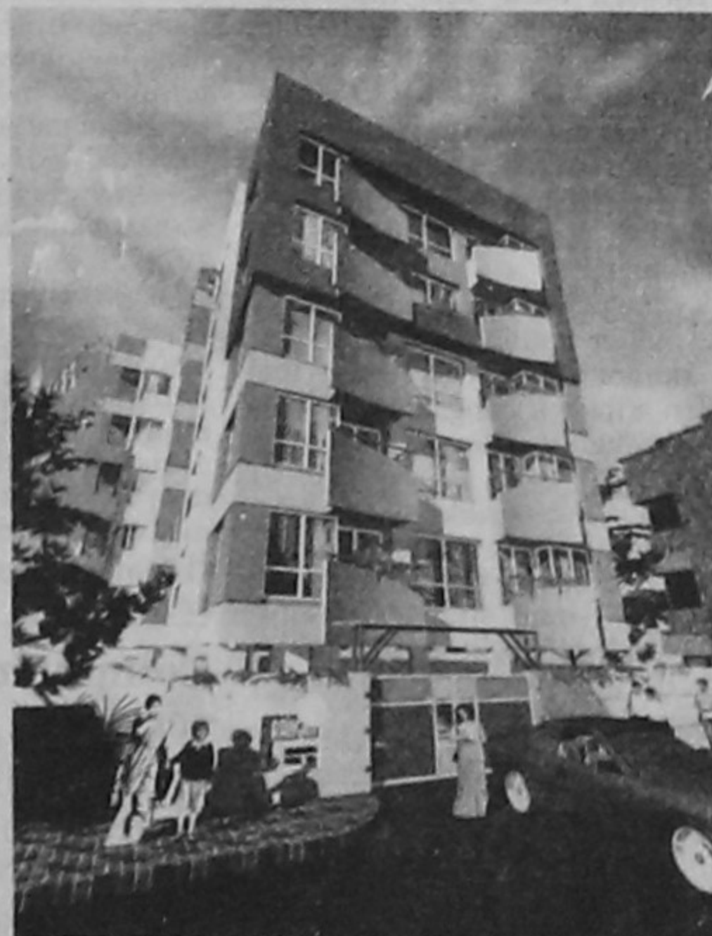
RANGAN at Shahidbagh.