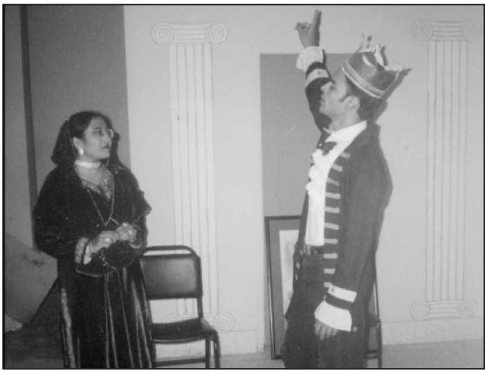
King Henry persuading Kate to love and marry him

What followed was the dramatisation of a rather large extract from the historical play Richard III . The background information that we were given was rather gruesome - that the disfigured Richard killed everybody in his way to the crown, including his brothers and his nephews. The chosen scene took place a few months after he had killed the prince of the ruling family and had only recently killed the king too. The curtains parted and Lady Anne was seen mourning in front of her father-in-law's corpse. The deformed Richard, in all black, swaggered onto the stage and Lady Anne immediately launched into curses and oaths. Her anger was portrayed perfectly and Richard, played by a third year student, made Richard both evil and attractive at the same time. He blamed her for the deaths of her husband and her father-in-law, he innocently pleaded that it was his desire for her that made him kill those two ("He that bereft thee, lady, of thy husband, did it to help thee to a better husband"). She spat on him. He even went down on his knees, opened his shirt and offered her his sword so that she could kill him, but of course she didn't ("Take up the sword again, or take up me").