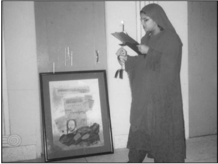
Lady Macbeth presenting her inciting speech