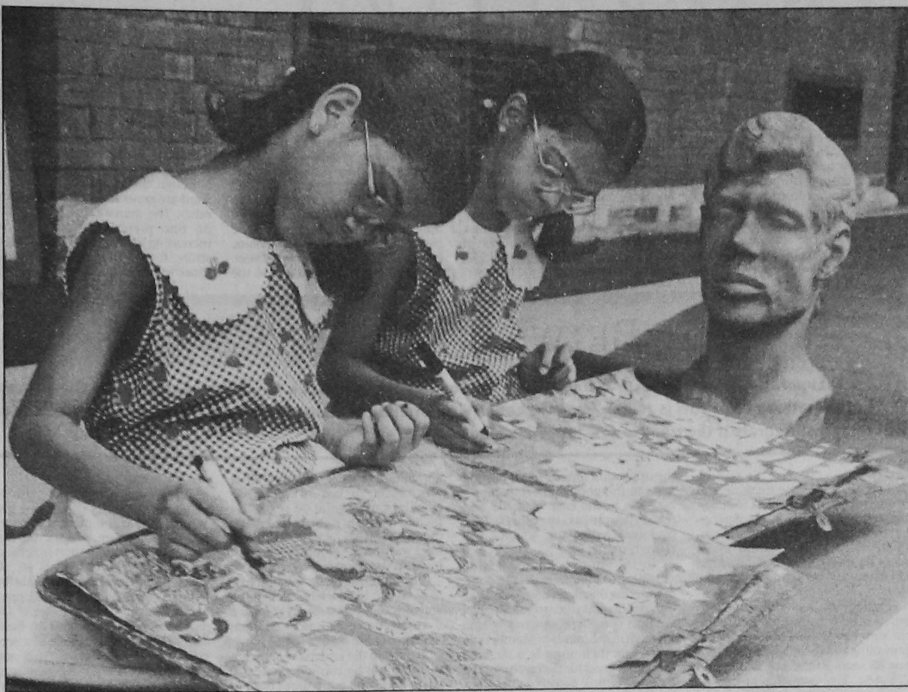
Two young girls participating in a drawing competition at the Institute of Fine Arts yesterday. The competition was organised by Bangladesh Cancer Society to mark World Tobacco-Free Day.