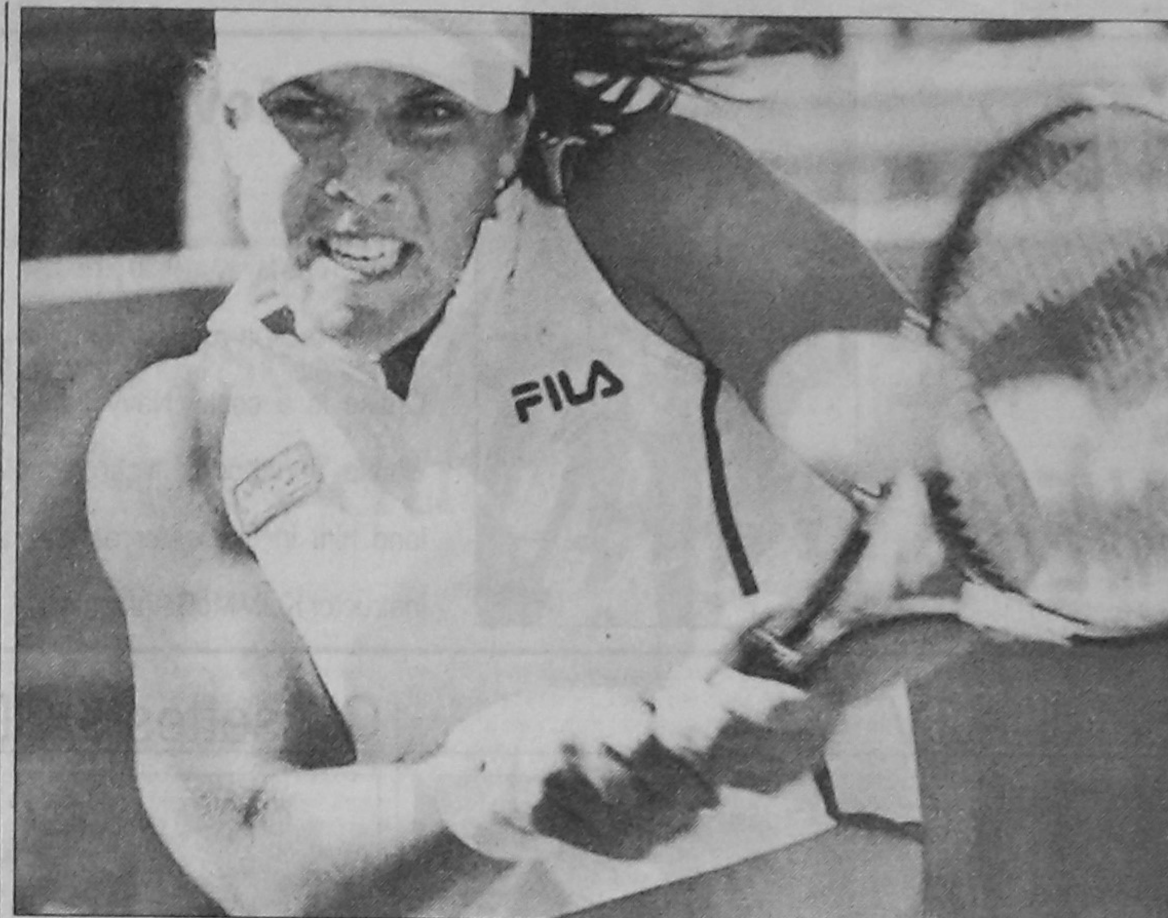
American Jennifer Capriati plays backhand against Jelena Dokic of Yugoslavia during their German Open engagement on Wednesday.