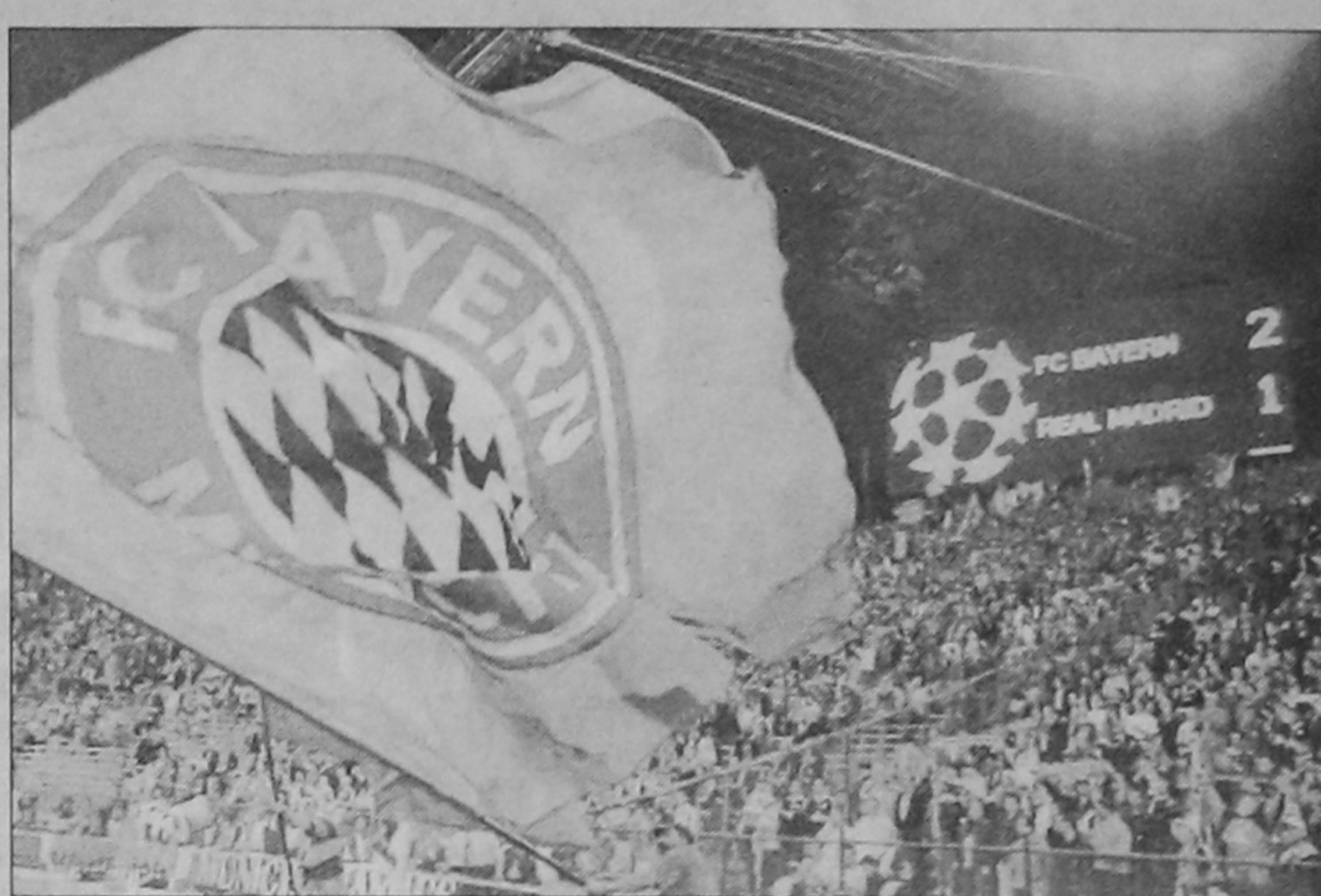
MUNICH OVER THE MOON: The Munich Olympic Stadium crowd bursts in euphoria after Bayern Munich reached the final of the Champions' League defeating holders Real Madrid on Wednesday.