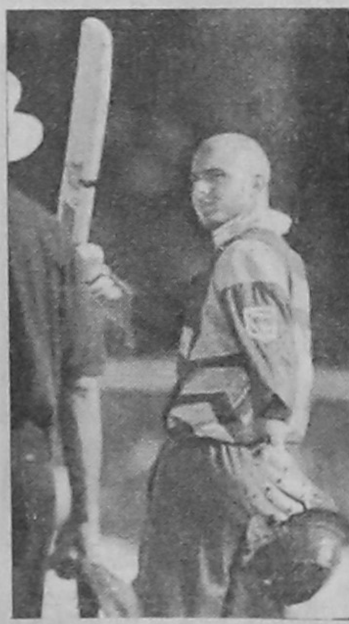
GIBBS ... m-o-m

It was the fourth comprehensive win in a row for South Africa.