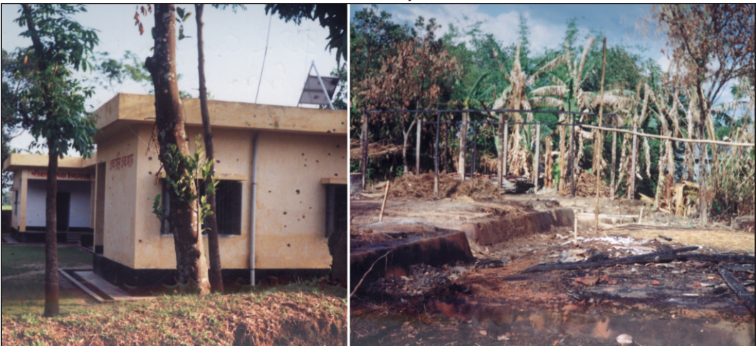
Bullet marks on the BDR camp (left) and completely damaged homesteads bear testimony to the April 18 skirmishes on the Roumari border in the country's north.