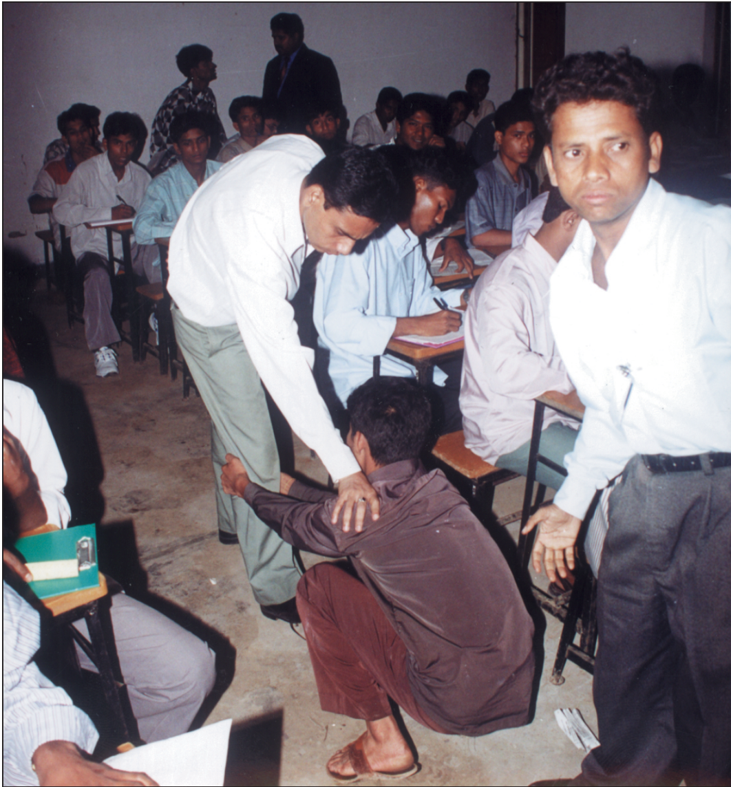
Caught red-handed... an examinee at a Daudkandi centre begs mercy from the invigilator after being caught while adopting unfair means on the first day of the HSC examinations yesterday.