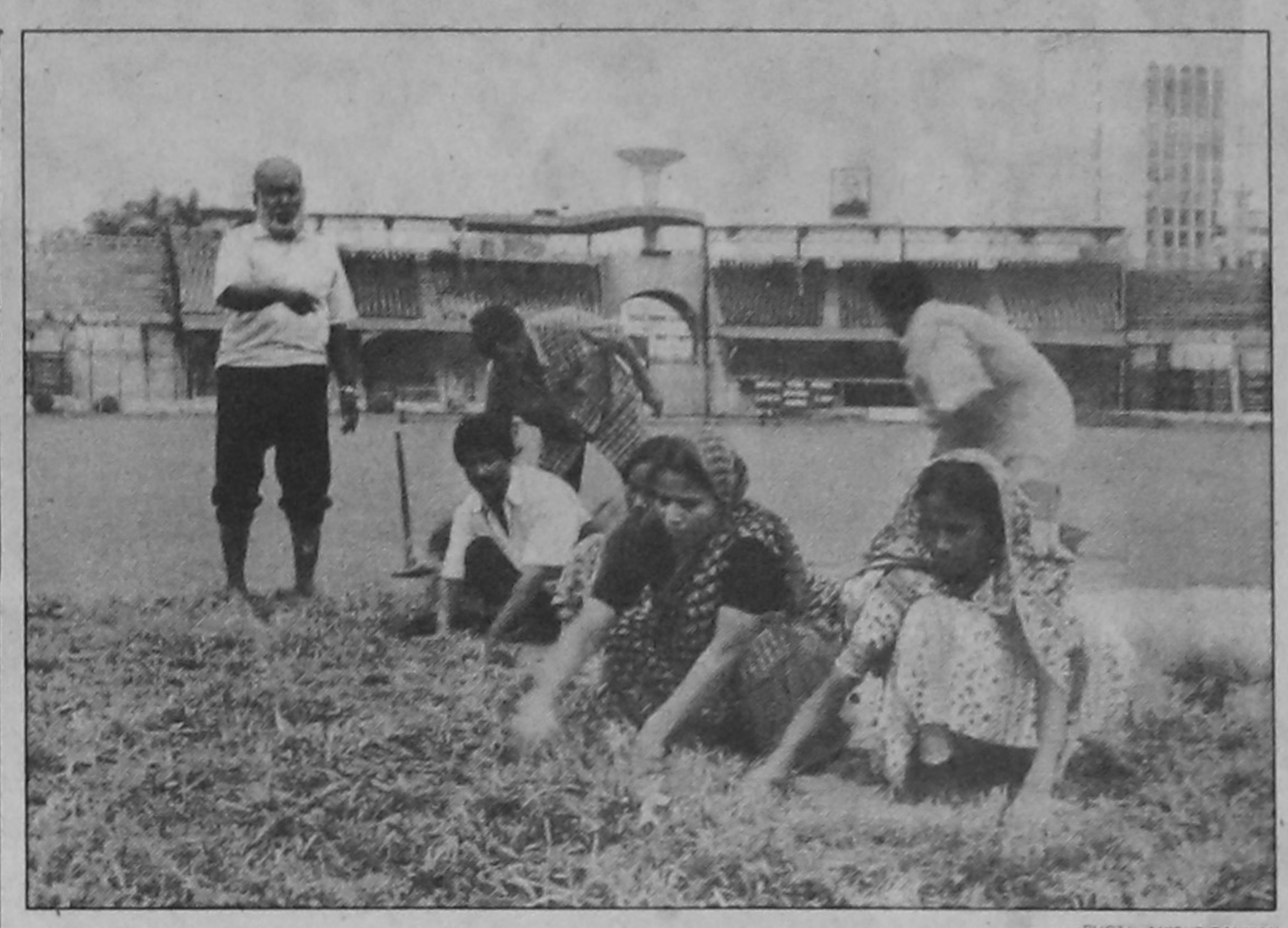
ENTER FOOTBALL, EXIT CRICKET: With the football season coming, workers sew grass patches on top of the cricket pitches of the Bangabandhu National Stadium on Wednesday.

The "Rawalpindi Express" appeared to be carrying some extra weight, did not run in at full speed and had clearly altered his action, bowling with a more studied approach and a longer swing of his right arm.