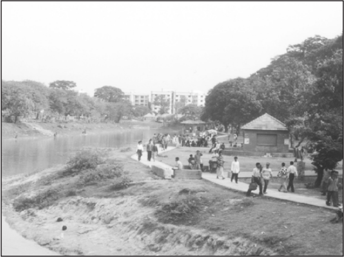
Walkway at Dhanmandi Lake. Architects: Utti Sthapati Brinda Ltd.