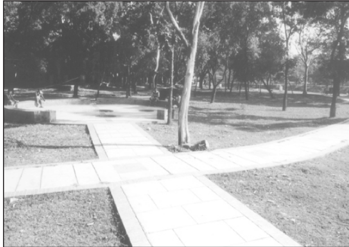
Seating area and walkway at Dhanmandi Lake. Architects: Utti Sthapati Brinda Ltd.

3:00 Opening Announcement 3:20 Open University 3:45 Shashatathya 4:00 Khabar 4:05 Cartoon: Casper 4:20 Shukhi Poribar 4:40 Documentary: Wild Nature Japan 5:20 Niramoy 5:45 Pushtitathya 6:00 Khabar 6:10 Kendrabindu: development programme 6:35 Programme from Chittagong station 7:00 News Headlines 7:05 Geet Bitan 7:30 Nupur Nikkon 8:00 News in Bengali 8:30 Drama Serial: Sorol Shitangshu 9:00 News Headlines 9:05 Film Show: Young Hercules 9:30 Drama Series: Aloukik 10:00 Serial: Carlie Chaplin 10:30 News in English 10:55 Geeti Bichitra 11:30 Khabar / The News 11:45 Closing EKUSHEY 12:00 Ekushey Midday 12:20 Bangla Movie: Shamir Shohag 2:40 Drishti 3:00 Ekushey Headlines 3:05 Bubuner Baba 3:30 Jononi 4:00 Chat Show Ek Cup Cha 4:30 Expedition to the Animal Kingdom 5:00 Circus Circus 5:30 Drishti 5:50 Aikar Potrikay 6:00 Ekushey Headlines 6:05 Classic Cartoons 6:30 Chardike 7:00 Bolte Chai 7:30 Ekushey News 8:00 Drama Serial: Bondhon 8:30 Drama 9:30 Shorashori 10:30 BTV News 11:00 Ekushey Nightly News