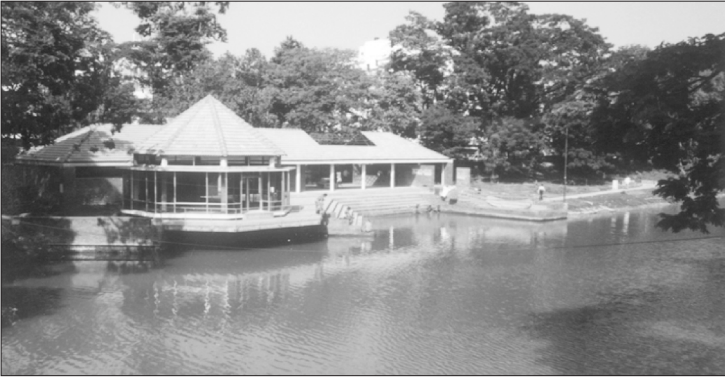
Boating club at Dhanmandi Lake. Architects: Utti Sthapati Brinda Ltd.

The paper said that in the third sector there will be a public toilet, rental parking area, skating arena, sitting plaza with kiosk for food, floating decks and footbridges, and plantations with landscape area for walkways to the footpath. The fourth sector, one was told, will contain a boat club with a souvenir shop and a floating coffee shop. There will be a walkway for footbridge, designed