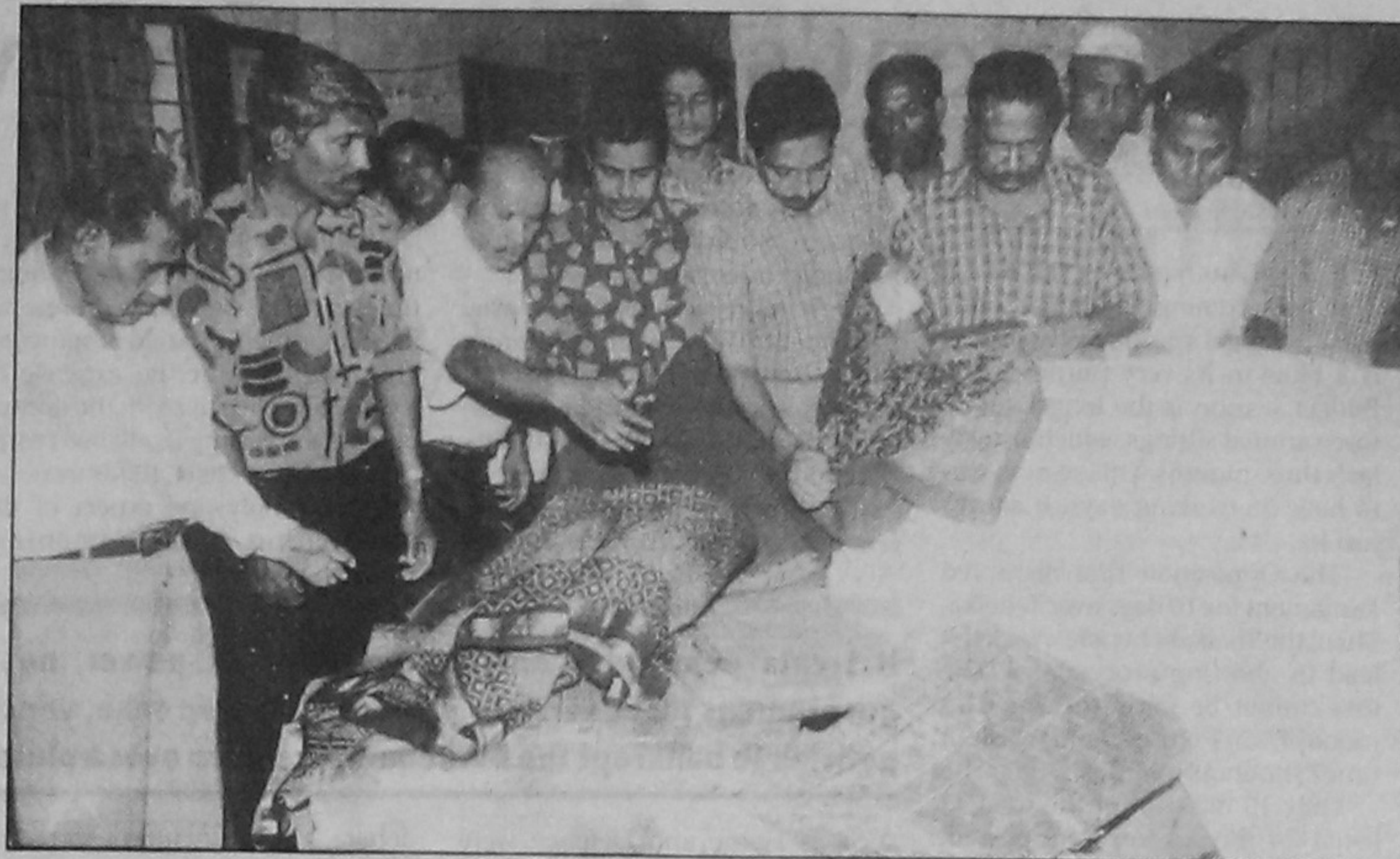
Customs officials yesterday seized smuggled Indian sarees worth about Tk one crore from the city's Nayabazar area yesterday.

গণস্বাস্থ্য ক্যাম্পাস সড়ার জাতীয় স্মৃতি সৌধের সন্নিহিত, ঢাকা- ১৩৪৪, ফোনঃ ৭৭০৮০০৩ ; ৭৭০৮০২৫ ; ফ্যাক্স নং-৭৭০৮০০৪ ইমেইলঃ ihsgk@citechco.net