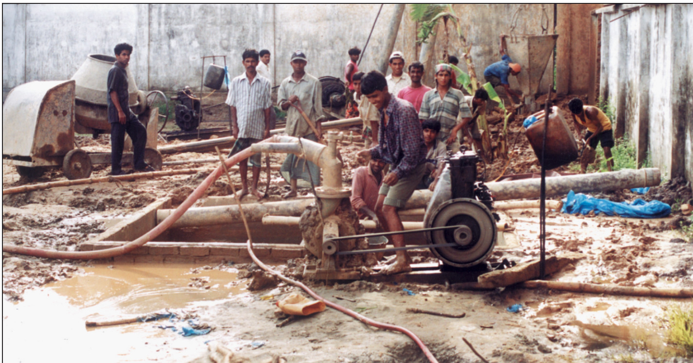
Piling work goes on in full swing at a lakeside plot at Gulshan in the city.