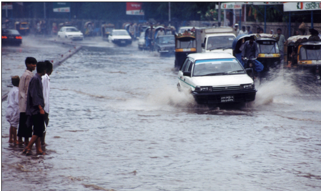
Motorised and non-motorised vehicles make way through knee-deep water near the Gulistan crossing in the city yesterday. Hours of moderate to heavy rain inundated many a major thoroughfare in the city.