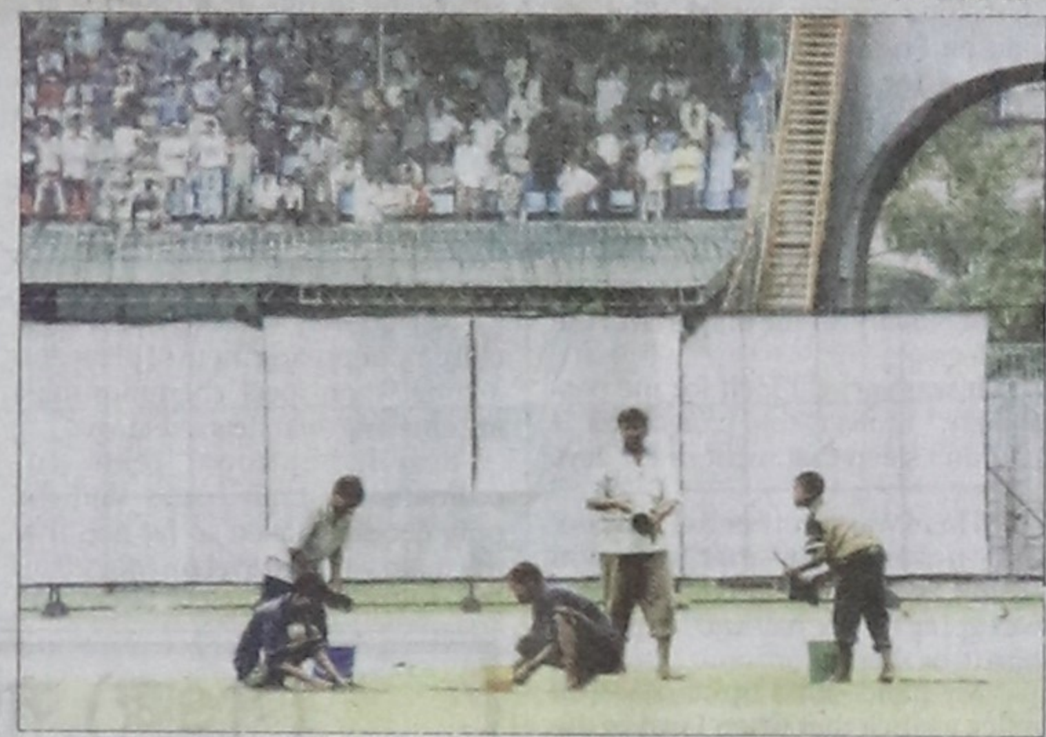
Groundstaff at the Bangabandhu Stadium sponging the water out of the field yesterday.