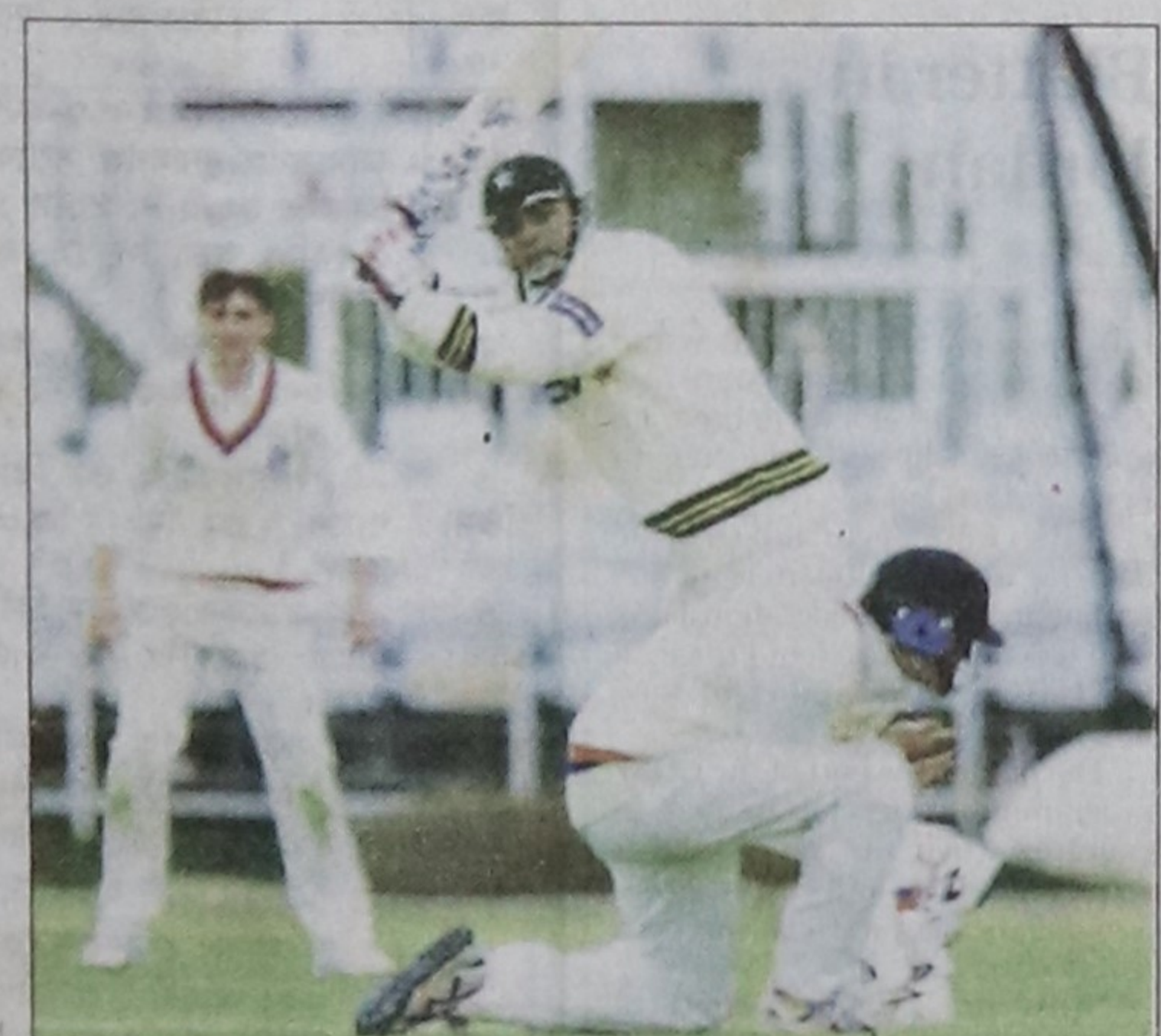
Pakistan's Inzamamul Haq works the ball on the on-side on the opening day of their three-day tour match against British Universities at Trent Bridge on Friday.