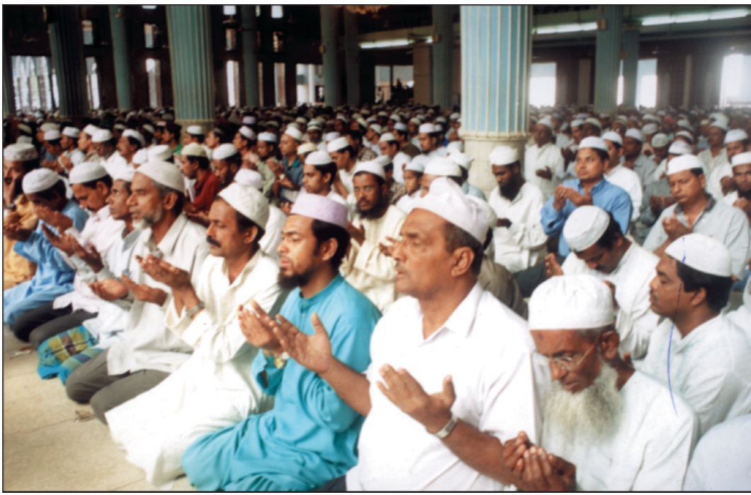
Devotees offering special munajat after Juma prayers at Baitul Mukarram Mosque yesterday expressing gratitude to the Almighty for the High Court verdict in Bangabandhu Murder Case.

The district BNP has organised the meeting to be held at Rajbari Railway Maidan in the afternoon.