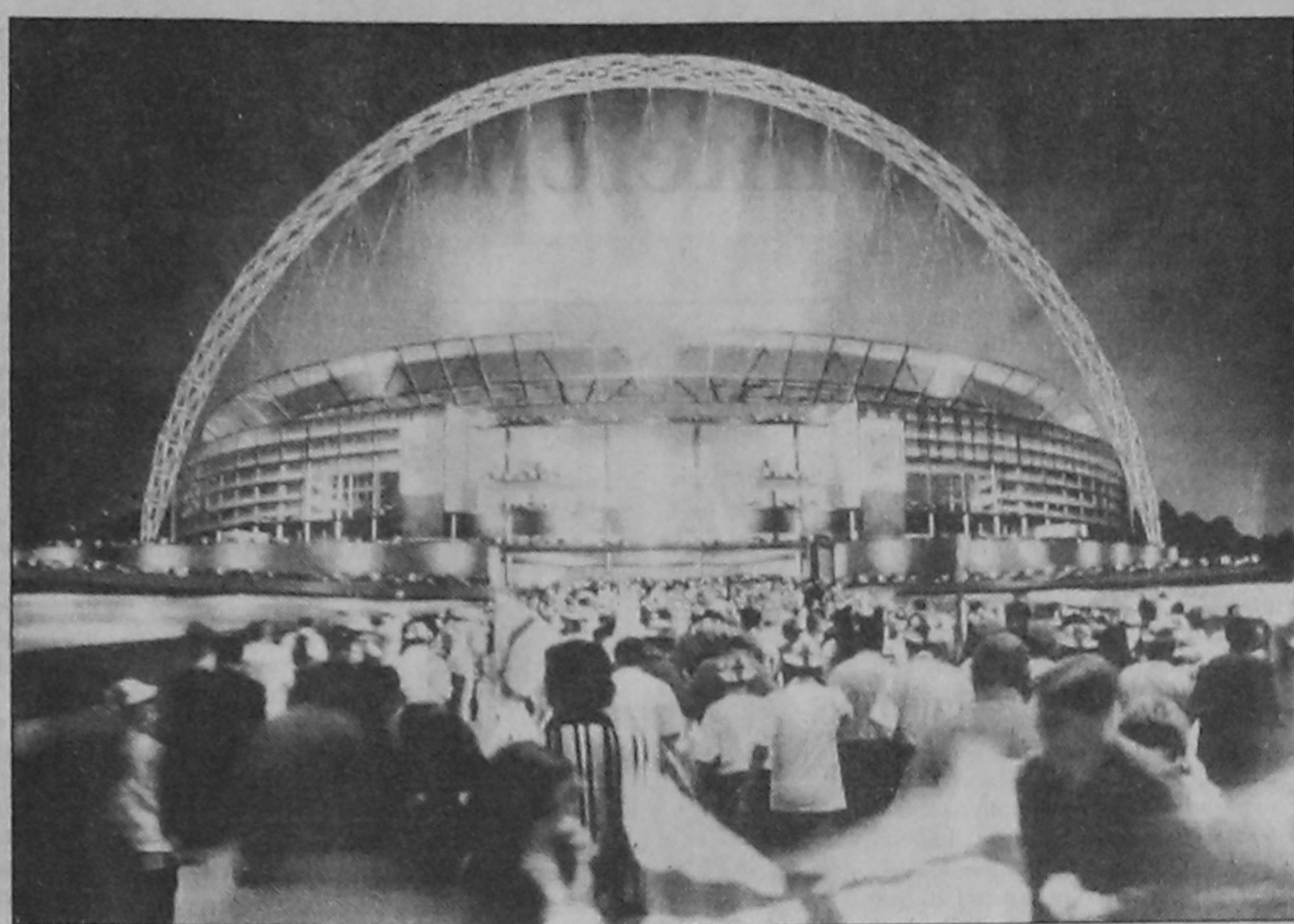
WILL IT SEE LIGHT? A computer-generated image of the would-be Wembley Stadium.