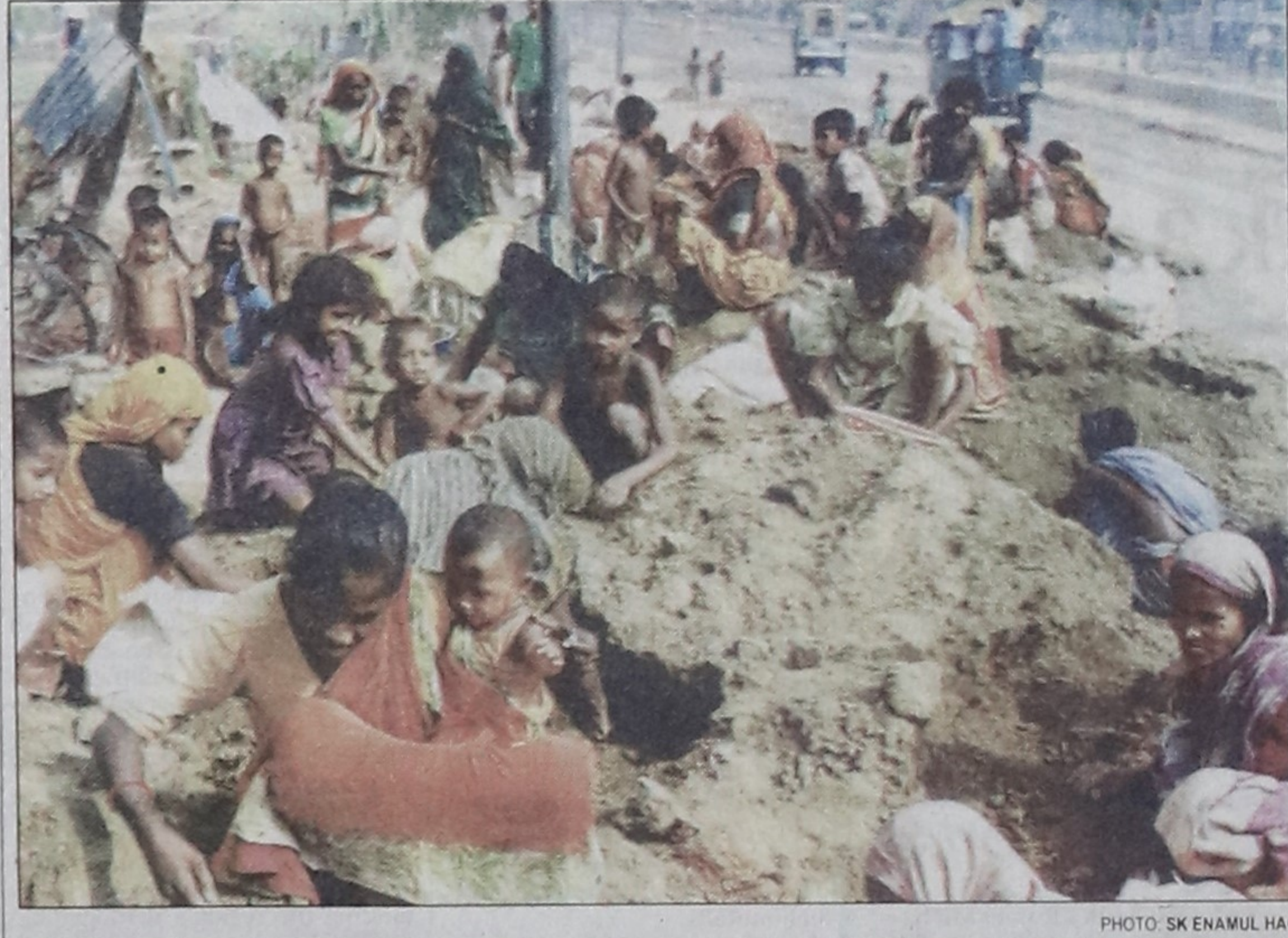
Sifting through sand for pebbles... whenever there is excavation of roads by utility service providers, these people show up with their children. They collect pebble and brickbats and sell those at twenty taka a sack.

The recent joint naval exercises by Bangladesh and Pakistan were carried out in international waters and were routine in nature, a defence ministry spokesman in New Delhi said yesterday.