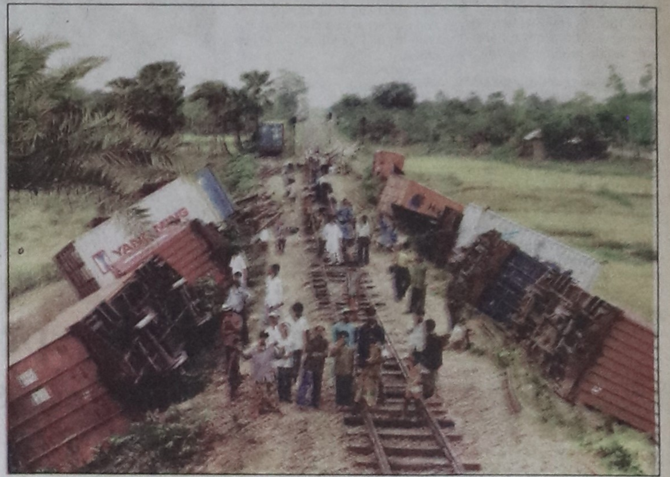
A Dhaka bound goods train from Chittagong carrying containers derailed at Pubail near Tongi Thursday night, disrupting rail communication in Dhaka-Chittagong and Dhaka-Sylhet routes for hours.

Railway sources said the schedules of at least half a dozen trains were cancelled due to the accident.