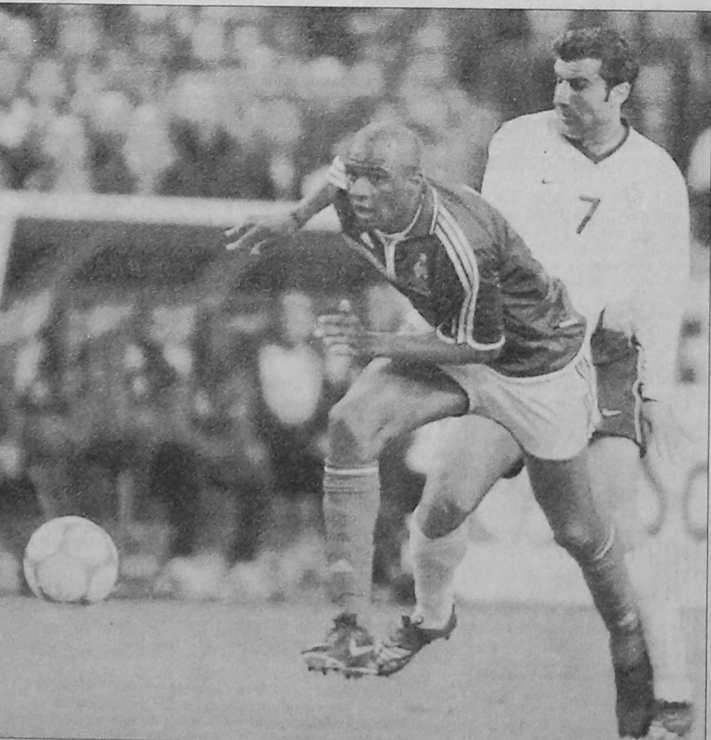
French defender Patrick Vieira (L) is under pressure from Portugal superstar Luis Figo during their international friendly at the Stade de France on Wednesday.