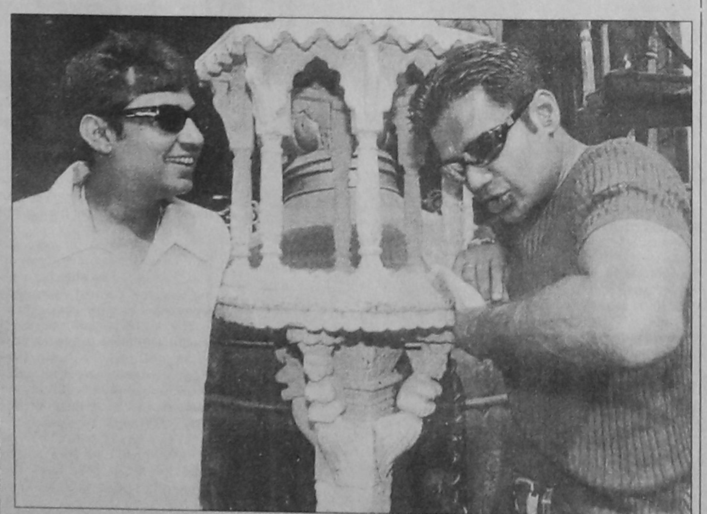
Banned Indian cricketer Ajay Jadeja (L) seems to be taking a few acting tips from Indian film star Sunil Shetty before the ceremonial first shots of a film he will be co-starring in at a Bombay studio on Thursday.