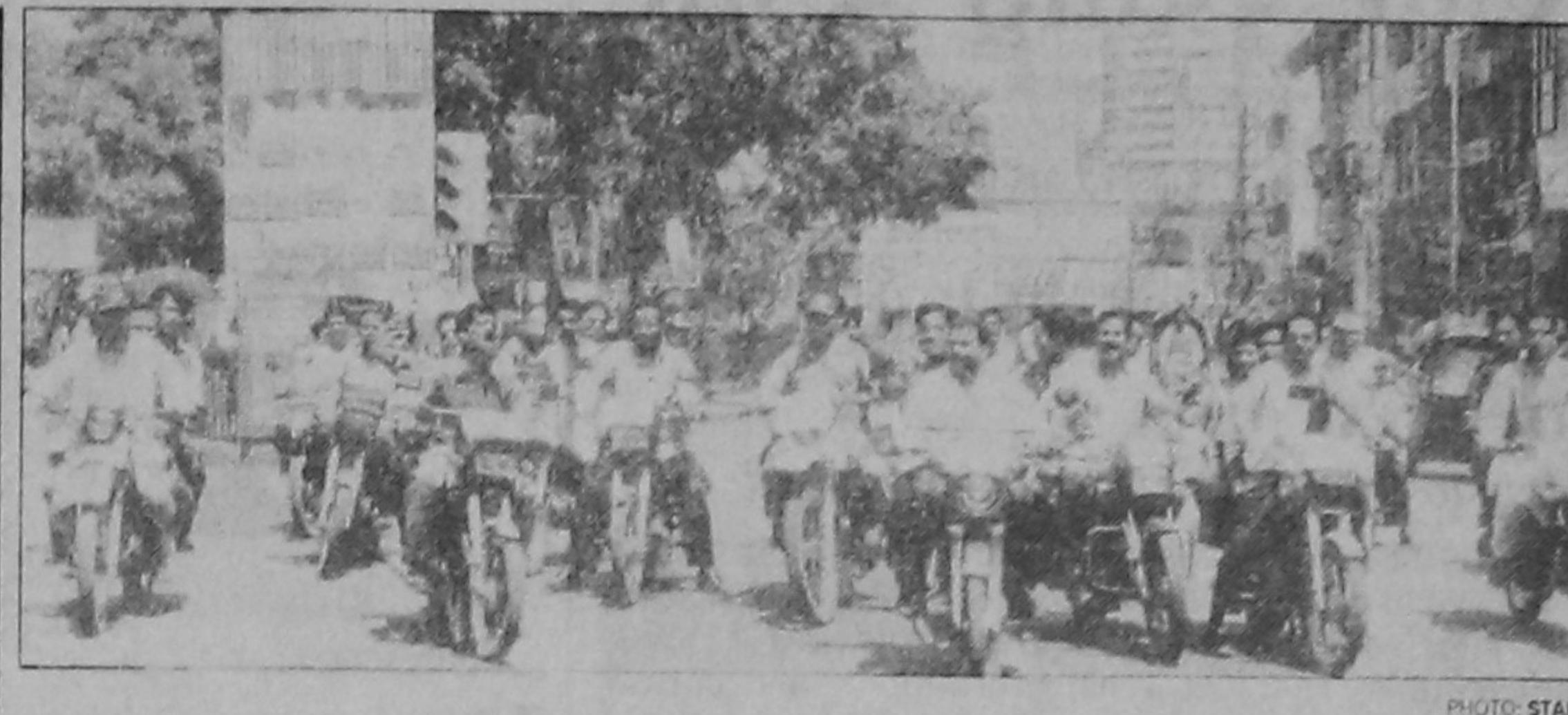
An anti-hartal motor-cycle procession in the city's 'Zero-Point' area yesterday.

PM opens largest Ashrayan Project BSS, Char Jabbar Prime Minister Sheikh Hasina yesterday inaugurated the country's largest Ashrayan Project unit at Char Mohiuddin in Noakhali district providing shelter to 640 distressed families. "None would remain without shelter," she said opening the unit as she sought blessings of the distressed people while handing over the and deeds and bank papers sanctioning Taka 10,000 for each family as soft loan. Sheikh Hasina said a total of 50,000 families would be rehabilitated in the first phase of the Ashrayan Project and so far 28,650 distressed families have been rehabilitated under the government-run programme across the country. The Prime Minister planted a sapling of a fruit-bearing tree marking the opening of the unit and went round different parts of the barrack to exchange pleasantries with the members including women of the distressed families. Addressing a rally at Char Jabbar, Sheikh Hasina recalled that Father of the Nation Bangabandhu Sheikh Mujibur Rahman undertook cluster village project for river erosion victims. "Awami League was created to bring back smile on the faces of the downtrodden and Bangabandhu was carrying that hard task. But the killers' bullets did not allow him to complete it," she said. But, she said, god willing, if