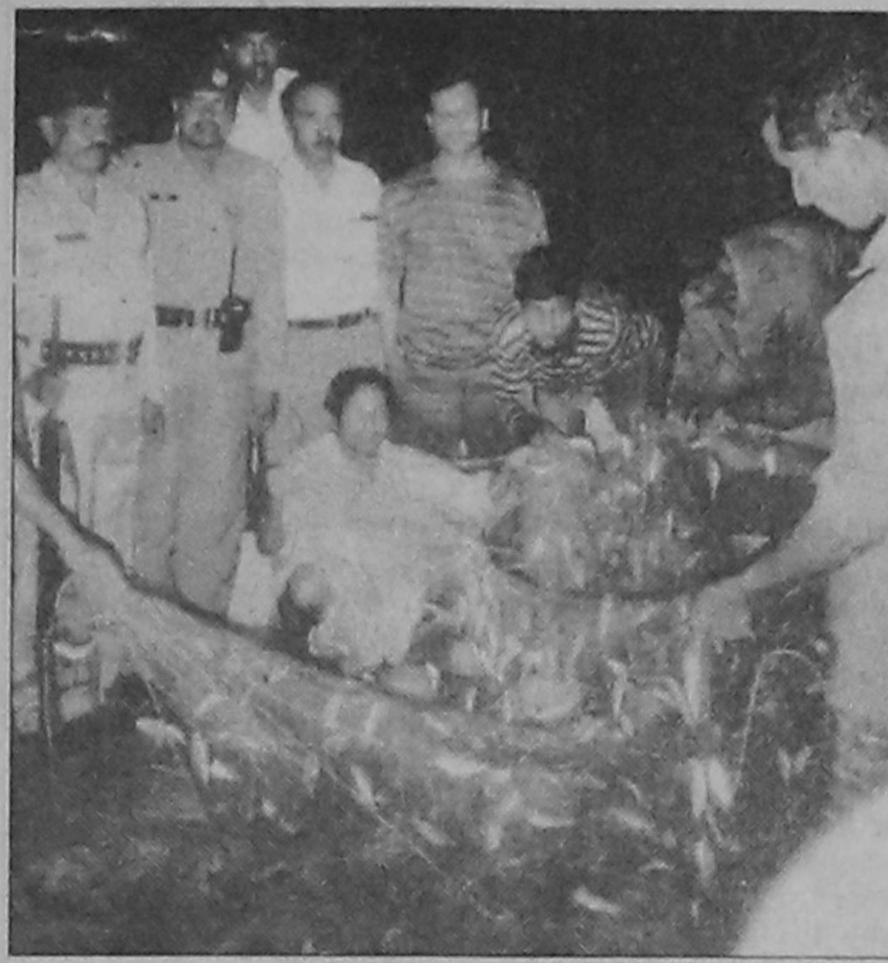
Pictures show officials with fishermen nabbed while catching fish fries with current nets (L) and seized nets being destroyed by officials at Chandpur (R).