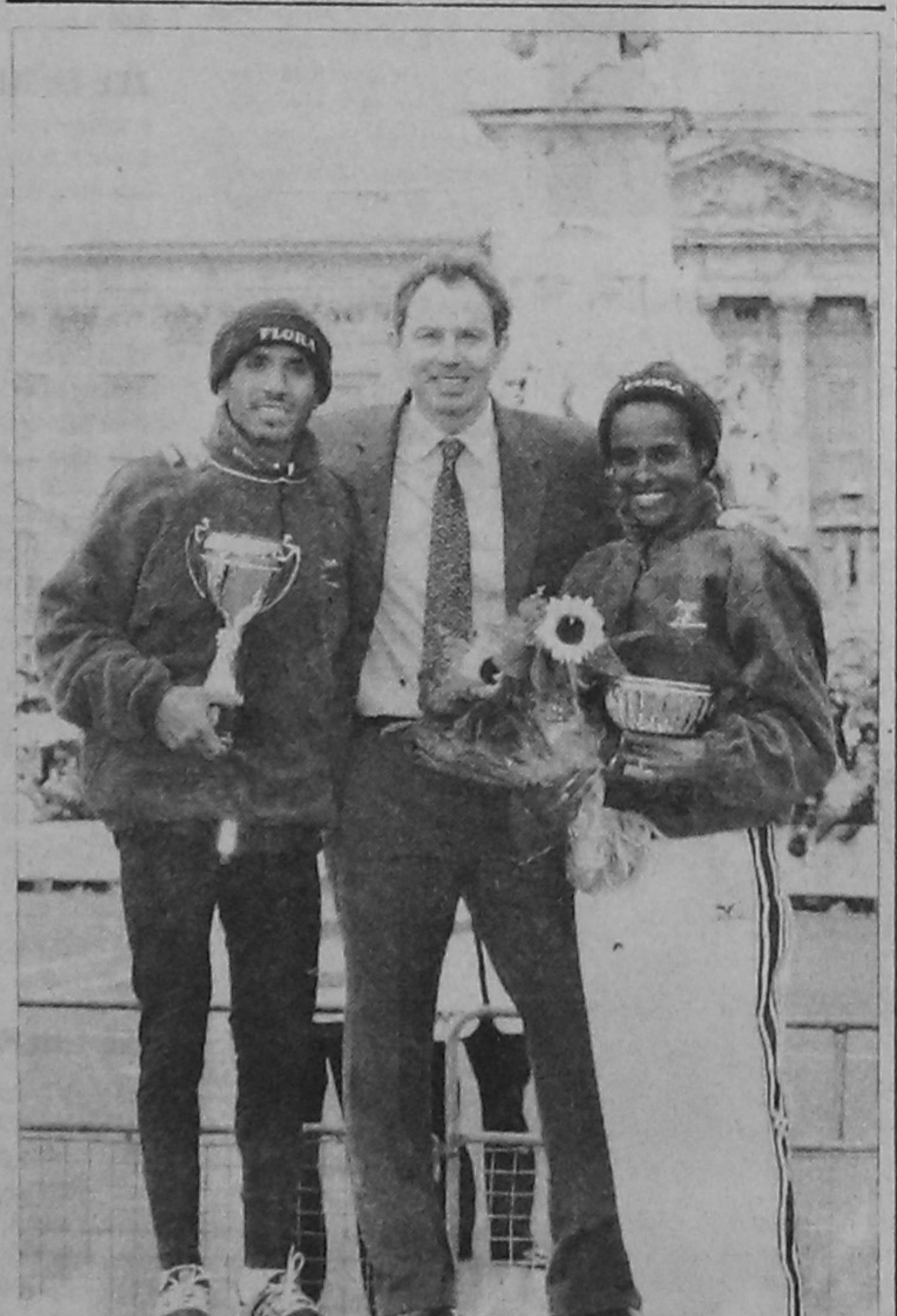
British Prime Minister Tony Blair poses with the London Marathon winners Abdelkader El Mouaziz of Morocco (L) and Derartu Tulu of Ethiopia on Sunday.

Left-arm pace bowler Chaminda Vaas then took over with five for 14 as India were skilted out for 54.