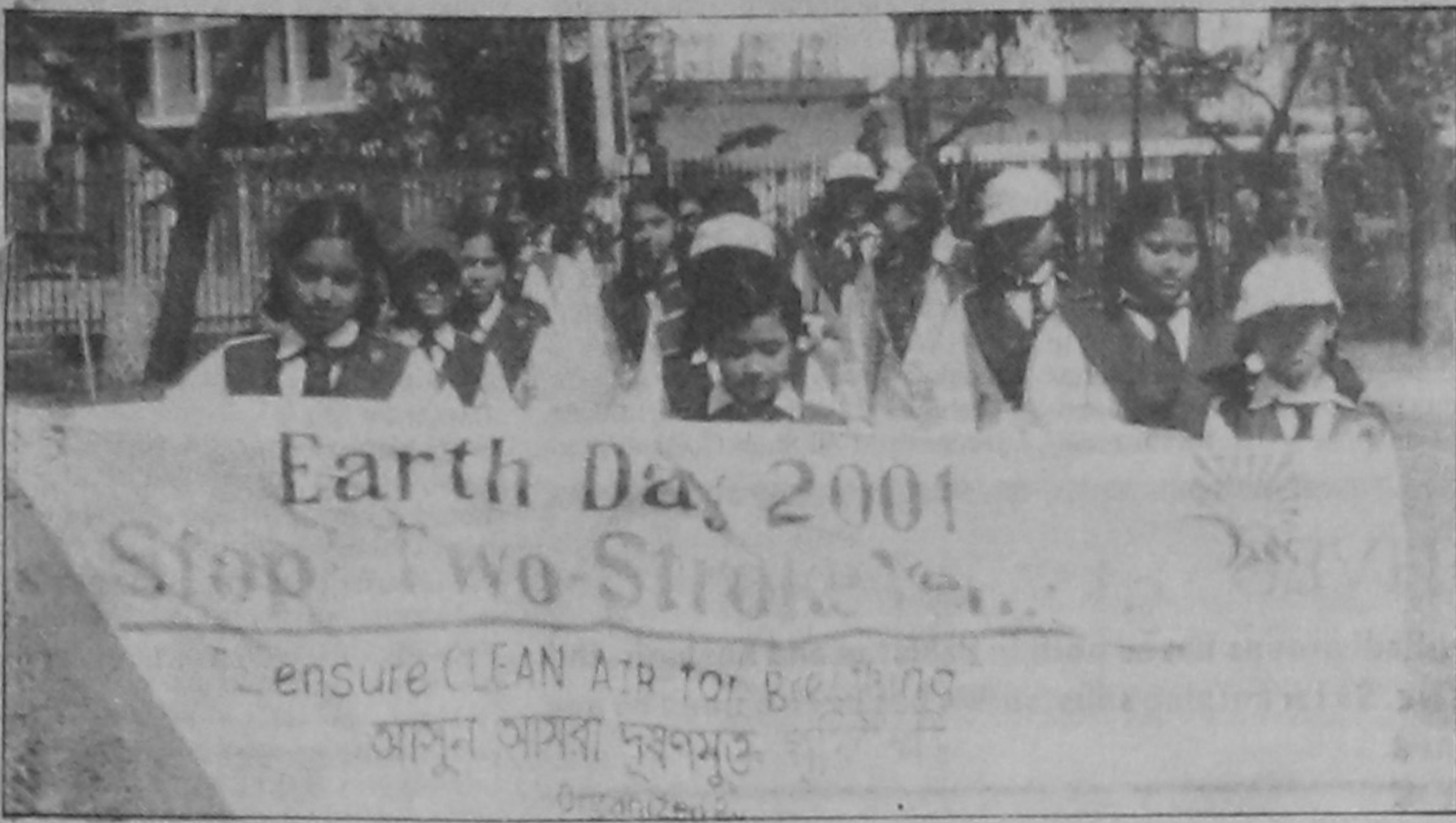
Environment and Social Development organisation launched a campaign in the city yesterday to raise awareness about the air pollution to mark the Earth Day 2001.