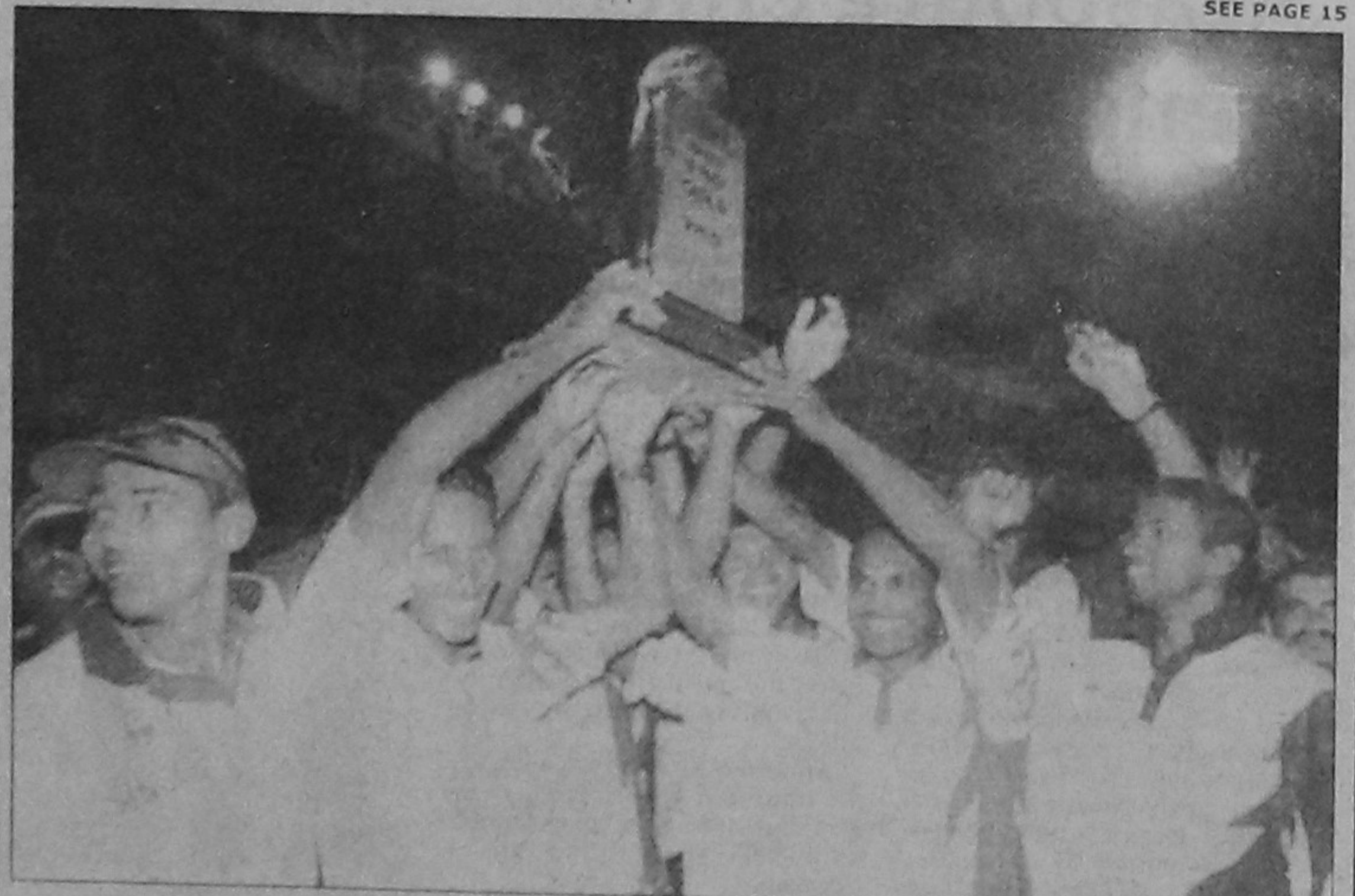
Sri Lanka cricketers celebrate with the Ary Gold Cup after they won the final against Pakistan in Sharjah on Friday.