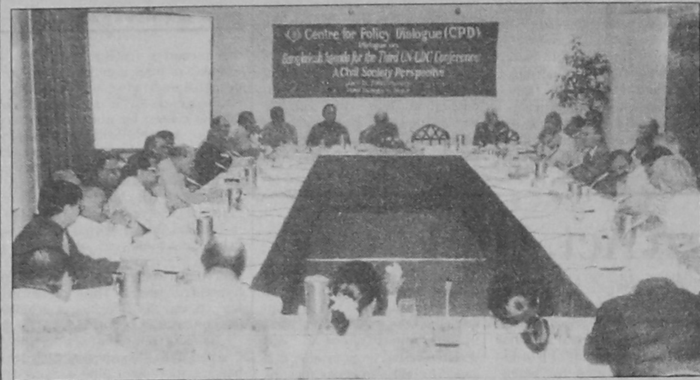
Picture shows the participants of a dialogue on 'Bangladesh Agenda for the 3 rd LDC Conference: A Civil Society Perspective' organised by the Centre for Policy Dialogue (CPD) at a city hotel yesterday.