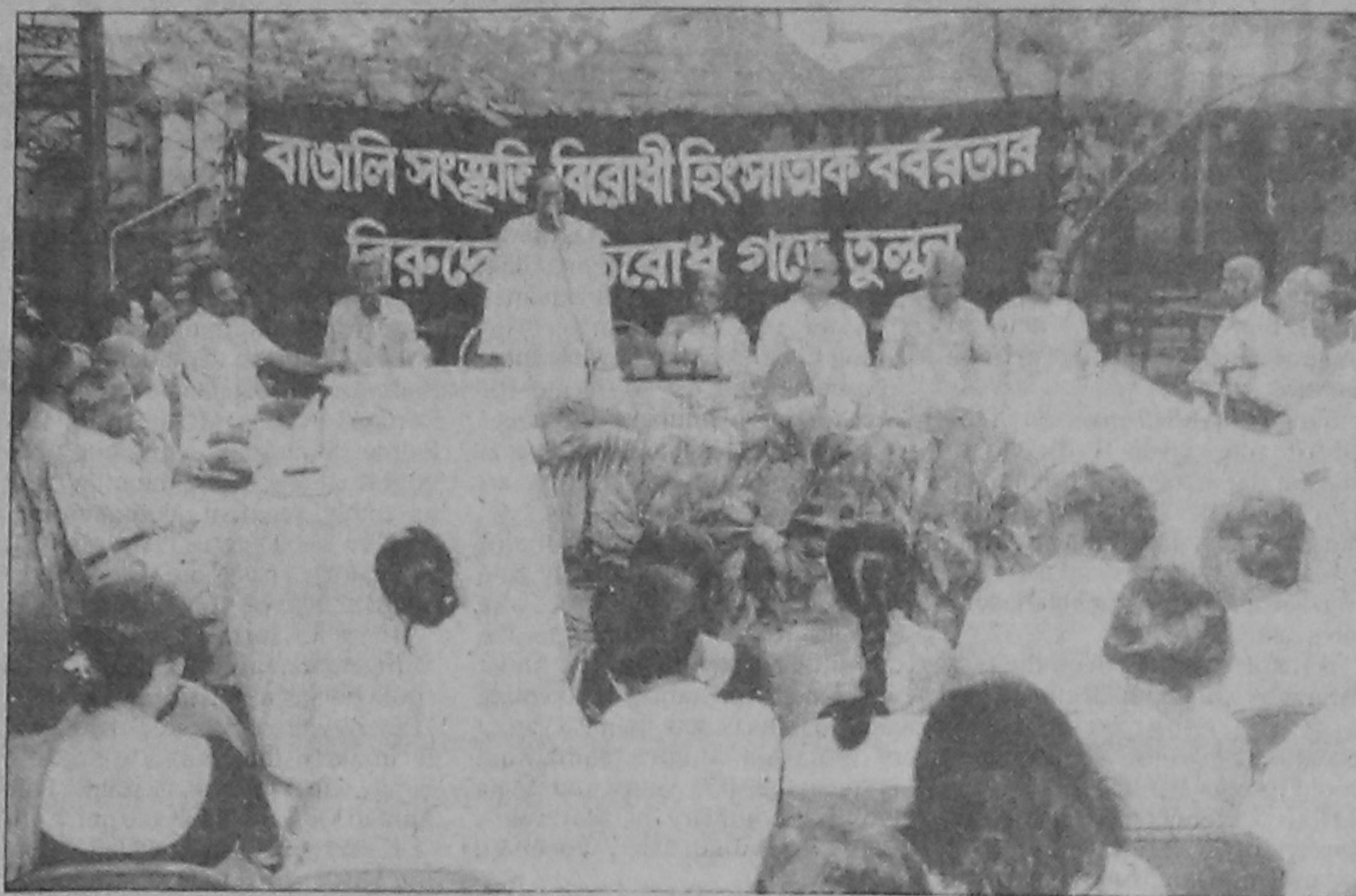
Representatives of civic society, leading organisations and members of the intelligentsia convened a consultative meeting at the Muktiyuddho Jaguhar yesterday. The meeting condemned all acts of barbaric violence against Bangalee culture and called for mass resistance against the evil forces who are out to destroy our culture and heritage.