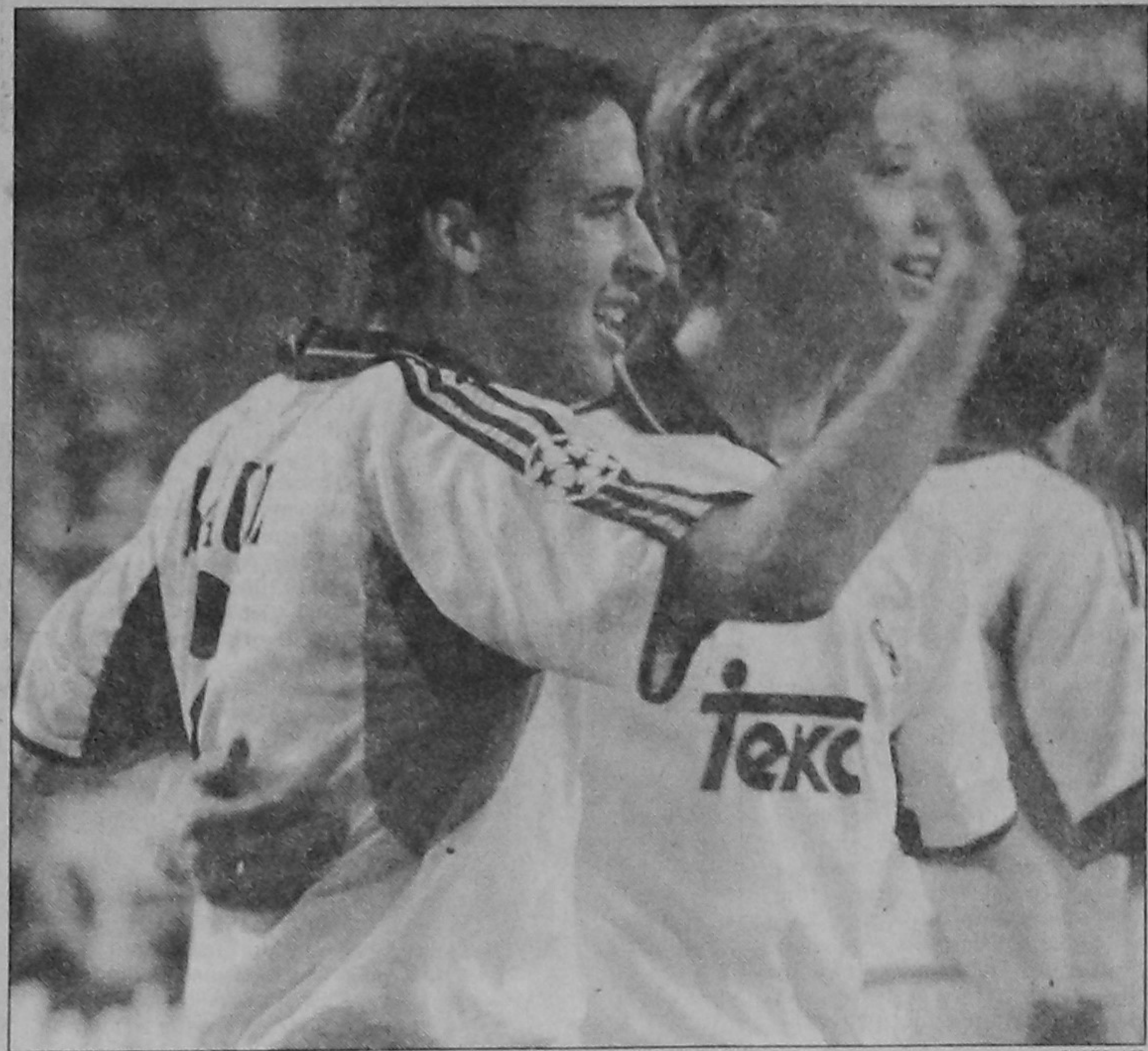
Raul, the Real Madrid ace, being congratulated by team mate Guti after scoring the first goal against Galatasaray at Madrid on April 18.