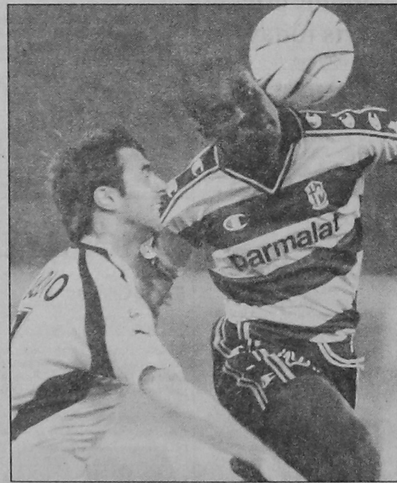
Parma's Lilian Thuram (R) tussles with Lazio striker Claudio Lopez at Rome on April 18.

Parma themselves threatened to upset the Romans' title dream when Fabio Cannavaro fired wide.