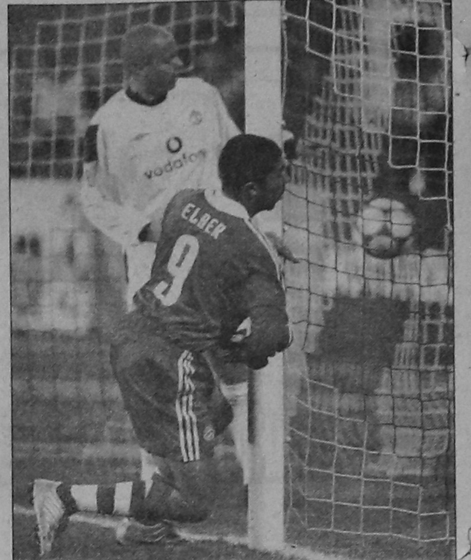
Bayern's Brazilian hot-shot Giovane Elber (R) puts his side into the lead at Munich on April 18.

Bayern coach Ottmar Hitzfeld chose Michael Tarnat and Frenchman Willy Sagnol to fill the two wing back positions left by France international Lizarazu and Bayern's second goal handed