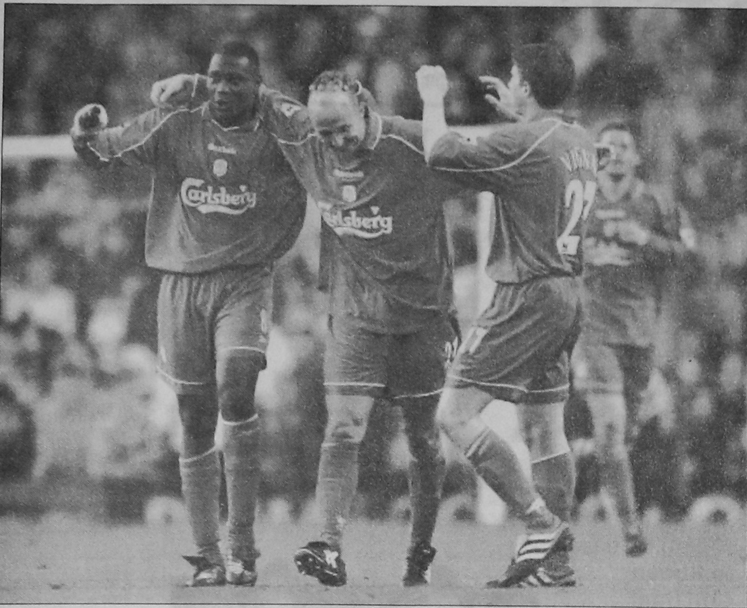
Liverpool's hero Gary McAllister (C) being congratulated by team mates Emile Heskey (L) and Gregory Vignal.