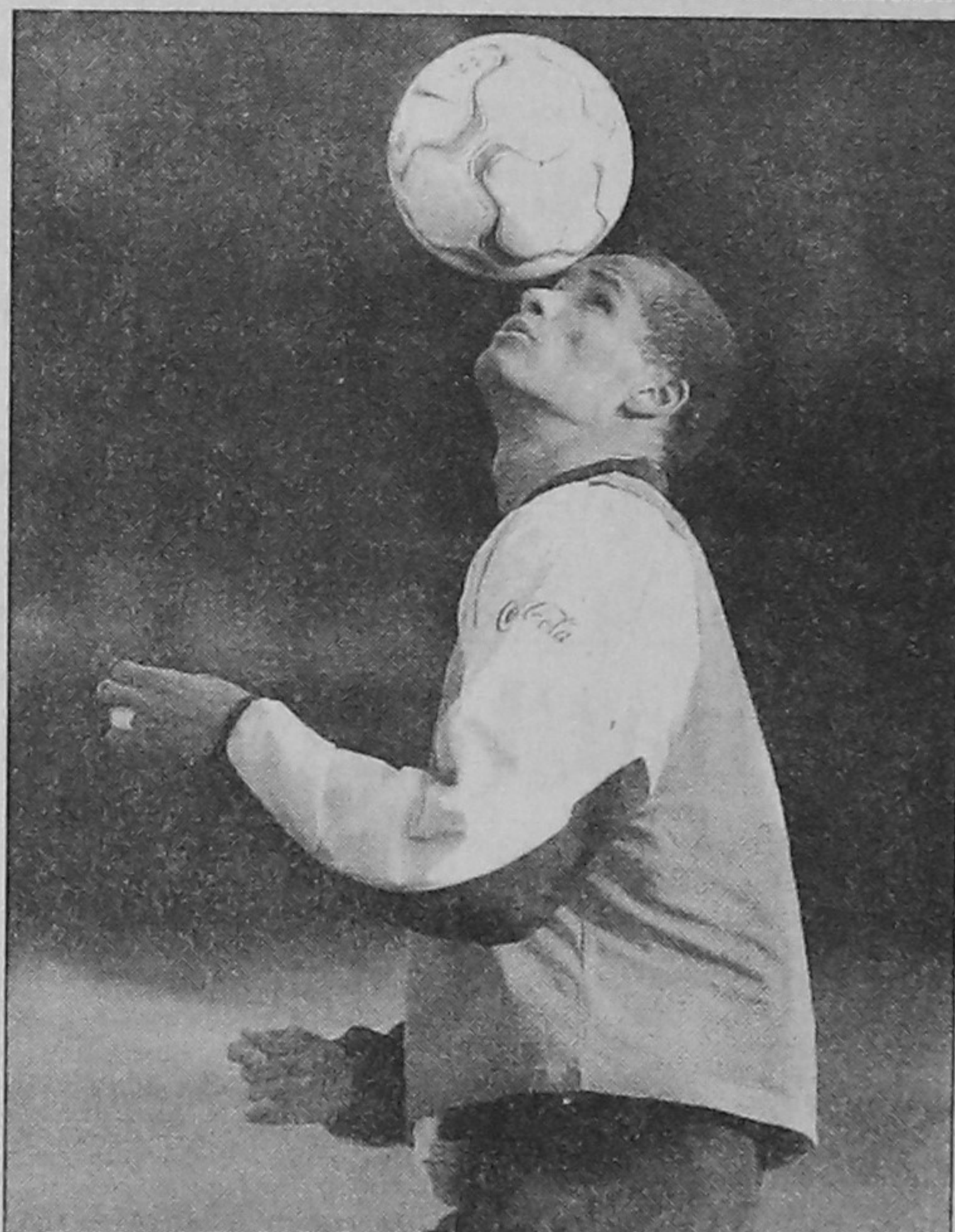
An AFP file photo of superstar Rivaldo.

However, club masseur Fredi Binder adopted a more cautious approach. "We are, of course, doing everything we can," he said. "But we'll just have to wait and see how it goes."