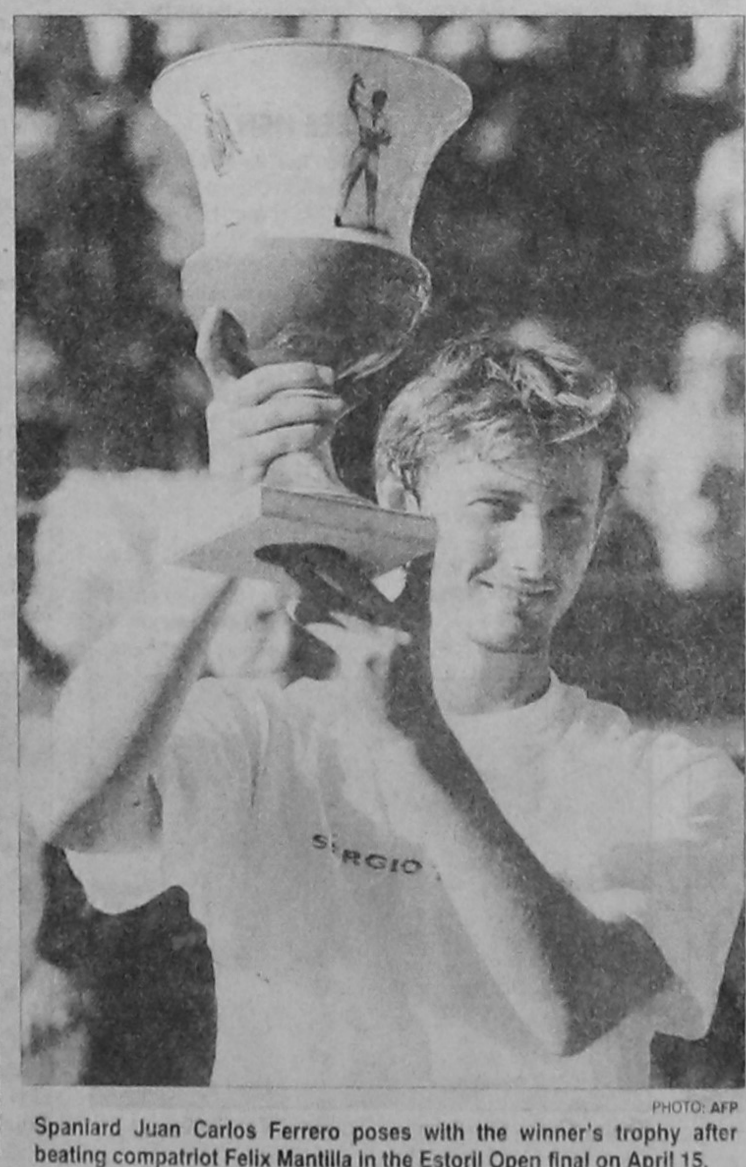
Spaniard Juan Carlos Ferrero poses with the winner's trophy after beating compatriot Felix Mantilla in the Estoril Open final on April 15.