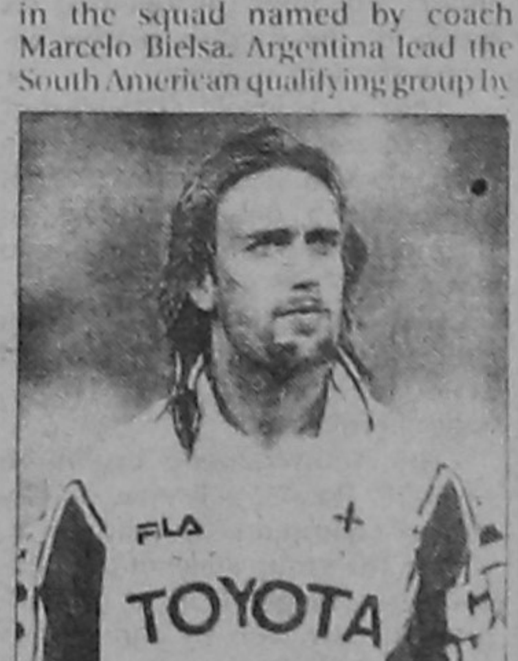
GABRIEL BATISTUTA five points. The top four quality for the World Cup and the fifth team