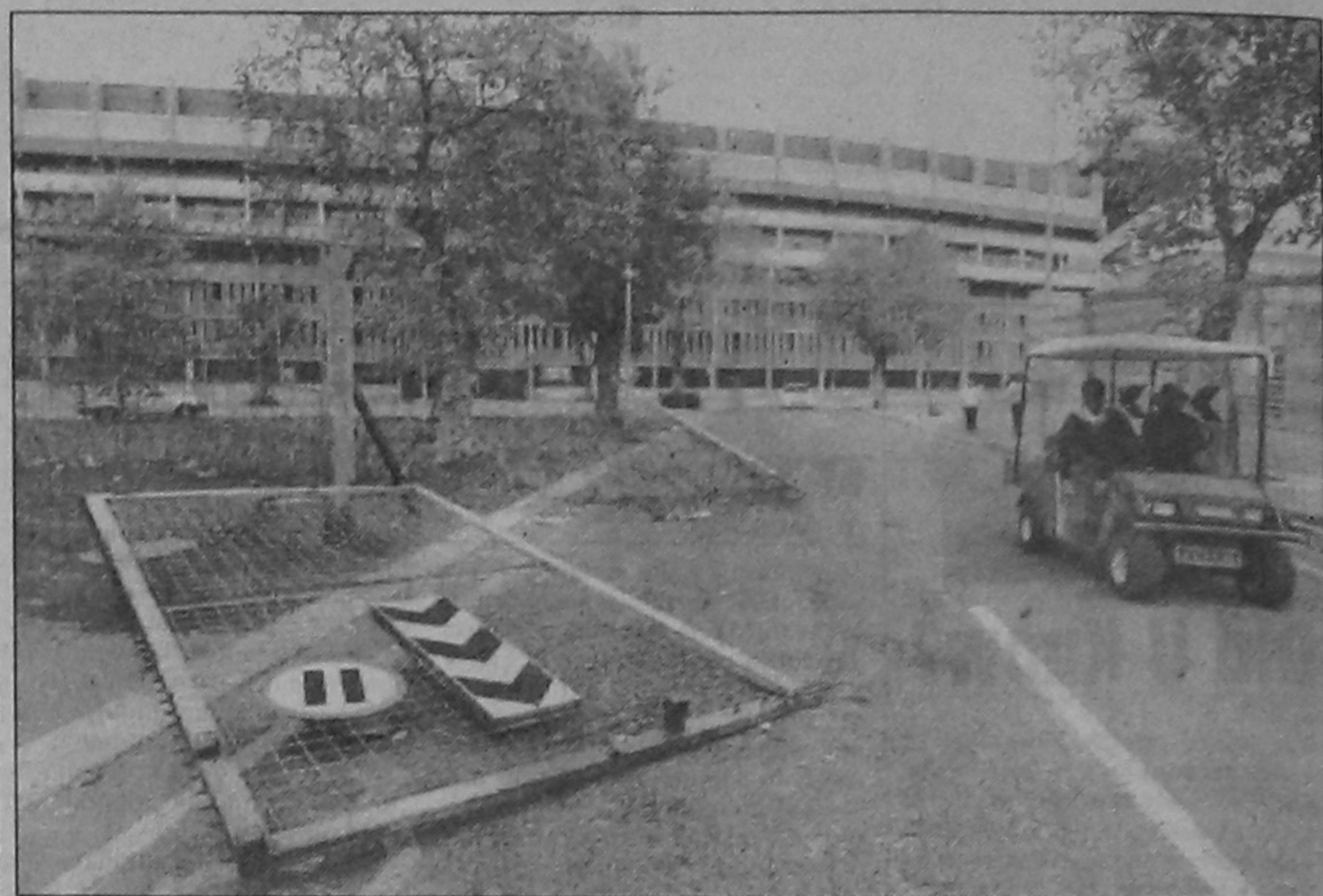
Barriers lie in the road outside Ellis Park rugby stadium in Johannesburg on April 12, where a soccer stampede killed 43 people.

"Everything has to be perfect. Things like this have been avoided at all costs."