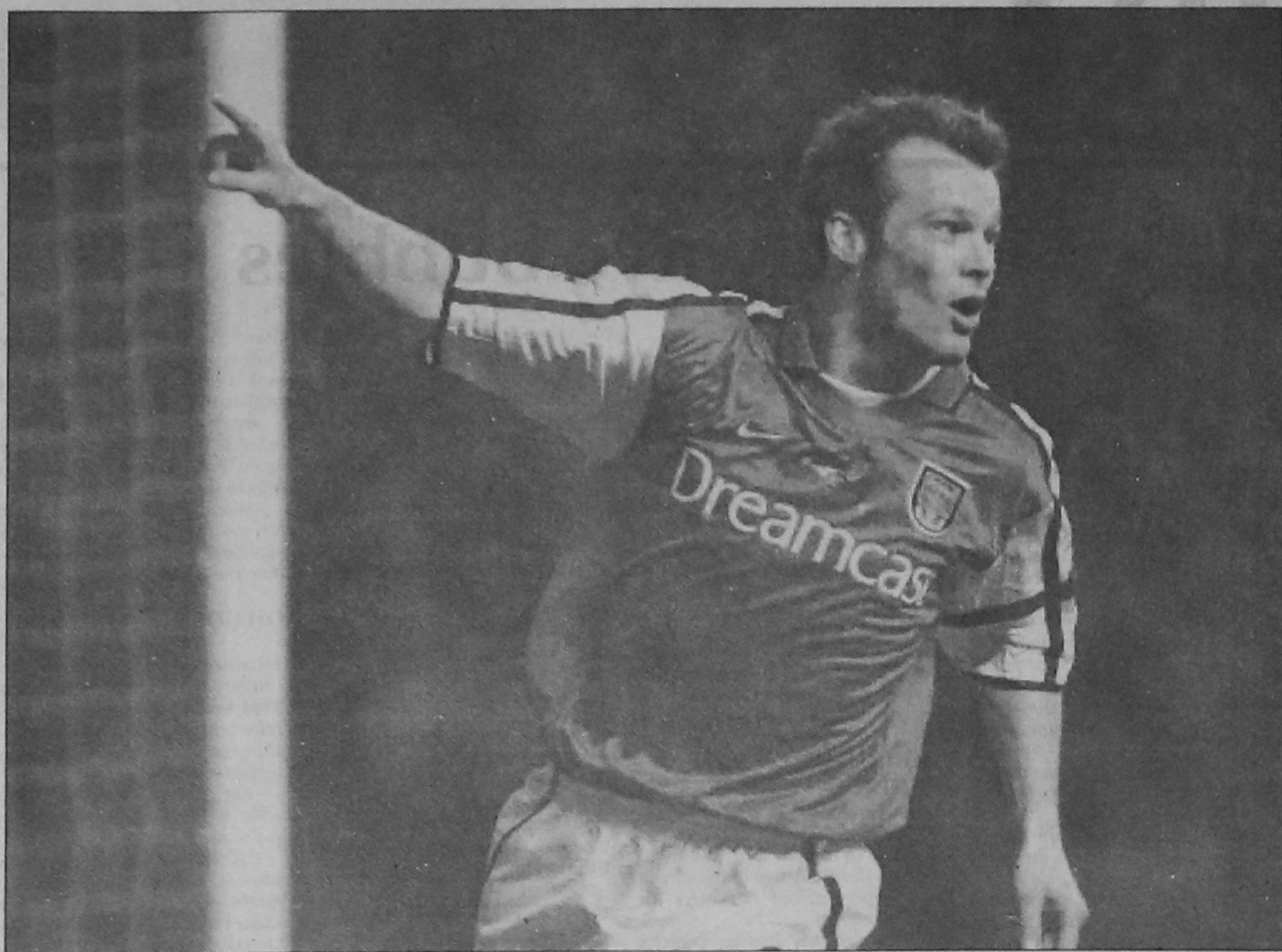
Arsenal's Swedish international Fredrick Ljungberg celebrates his second goal against Manchester City.