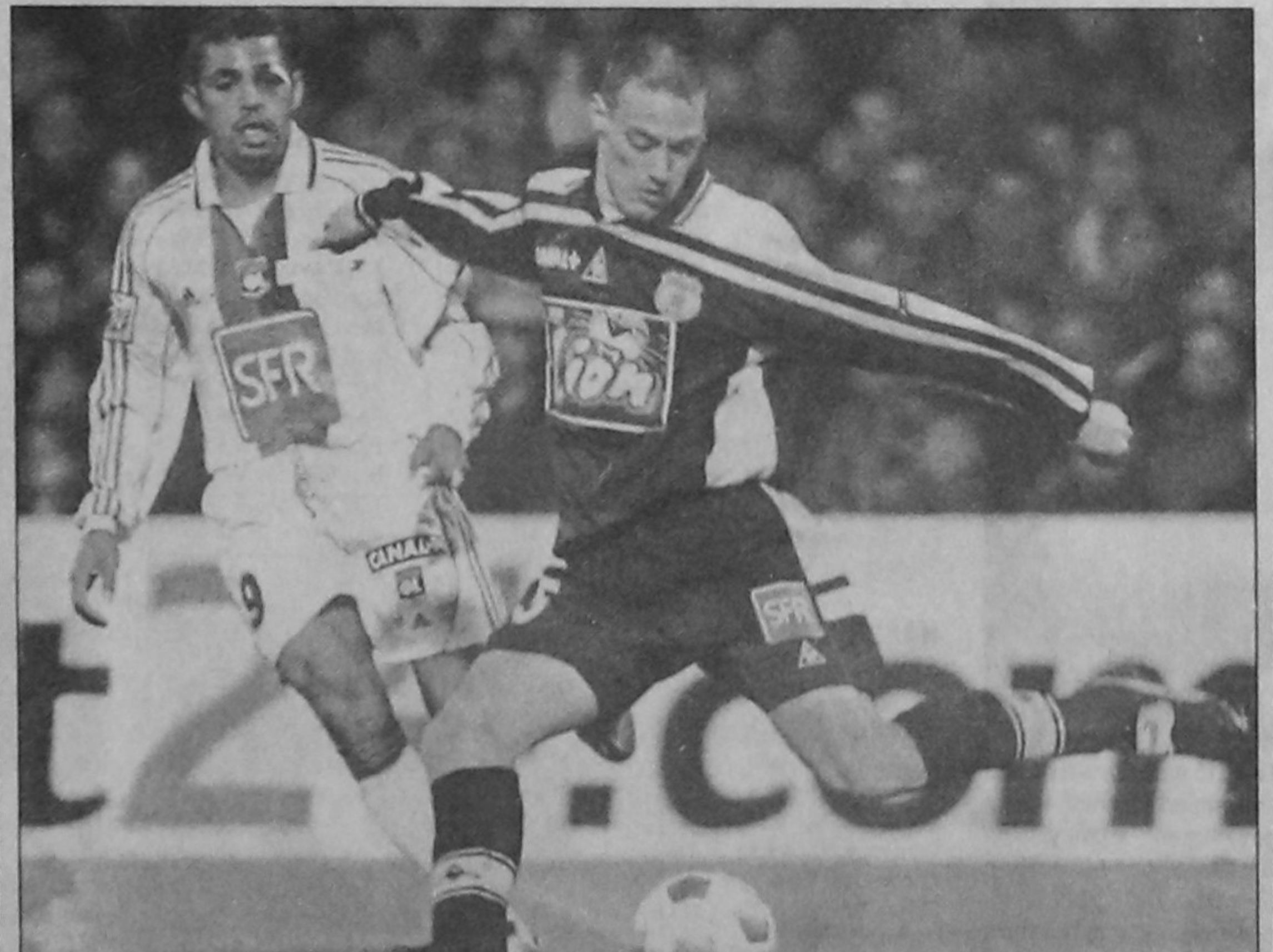
Nicolas Gillet (R) of Nantes clears while Lyon's Brazilian ace Sonny Anderson looks on during their French League Cup semifinal at Lyon on April 10.

AFP, Valencia Kily Gonzalez will miss Valencia's Champions League quarter-final second-leg tie with Arsenal after tearing a muscle in his club's league tie at the weekend, club doctors said Tuesday.