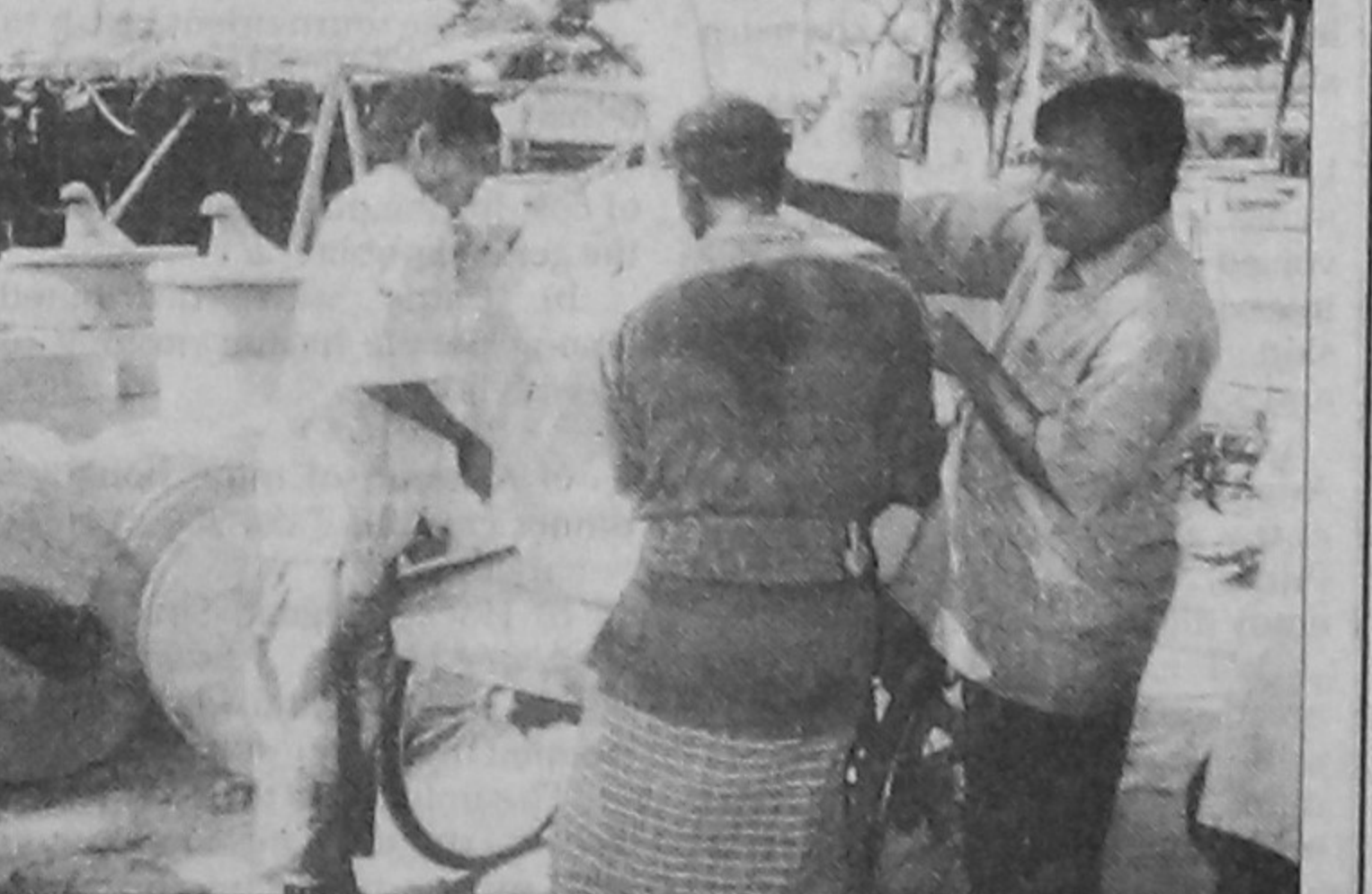
One worker of Uttaran, a Non-governmental Organisation (NGO) distributing sanitary latrine to a flood victim of Shibpur under Sadar upazila in Satkhira district recently. The organisation distributed 2,000 sanitary latrines among the flood affected people of the district.

PPD started implementing Water and Sanitation programme since early 1990 in co-operation with NGO Forum for Drinking Water and Sanitation. Under the programme it is supplying cost-effective tube-wells that enables water to draw from 20 to 35 feet deep. Only members of village development committee are eligible for loan between Taka 3,000 and Tk 20,000 on easy terms for purchase of the tube-wells and latrines. "So far we have disbursed over Taka six crore to our members since 1995 and demand is increasing everyday," said Nazneen. A poor young farmer in Alokdia village said, "I do not have sufficient money to buy a tube-well but with loans I already bought one which I share with another six neighbouring families." PPD is executing its activities mainly in Shajadpur and Ullapara upazilas in Sirajganj district and Sherpur upazila in Bogra district. With technical assistance from NGO Forum it has also constructed six arsenic iron removal plants and five rainwater harvesting plants. A total of about 100 families use the facilities. Each of the iron arsenic removal plant costs about Tk 8,000, twenty per cent of which comes from the beneficiaries and the rest is borne by PPD. Through such programmes NGO Forum has covered over 86 villages under its WATSAN programme in Bogra region which includes training of over 1,500 local NGO workers and 630 ordinary people of the community and 1,400 caretaker women.